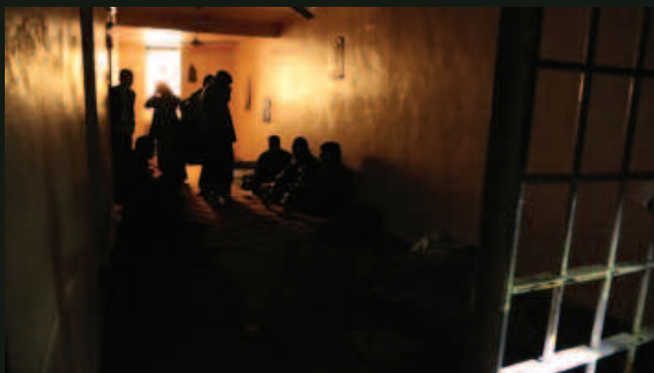
Screenshot from footage shows prisoners sitting in their cell in Malkiyah (Dêrik) prison in February 2013.

As the de facto authority in these regions, the PYD is obliged under international human rights law to grant the people in the areas it controls – Kurds, Arabs, Syrians, and others – their fundamental rights.