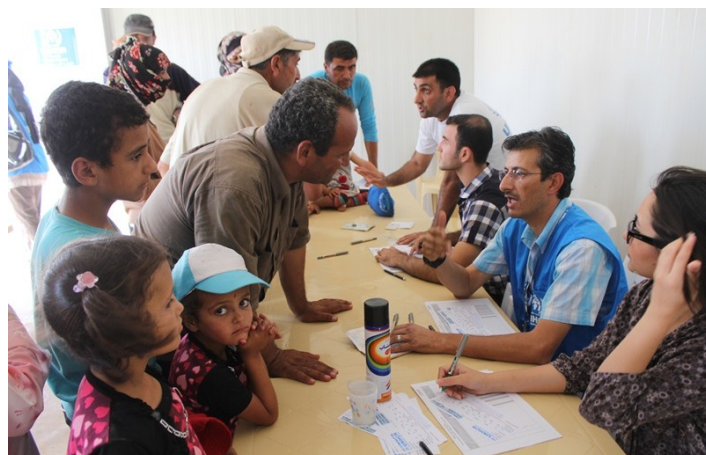
Syrian refugees being registered in the Kurdistan Region, north Iraq.