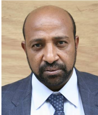
Berhanu Negga