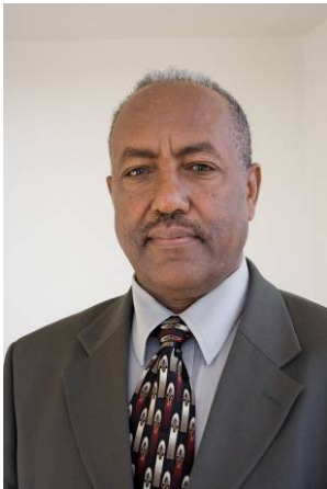
Yakob Hailemariam © Amnesty International