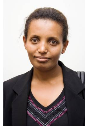
Birtukan Mideksa