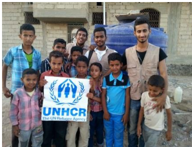
IDPs in Aden benefited from UNHCR NFI distribution. 10 April 2016.