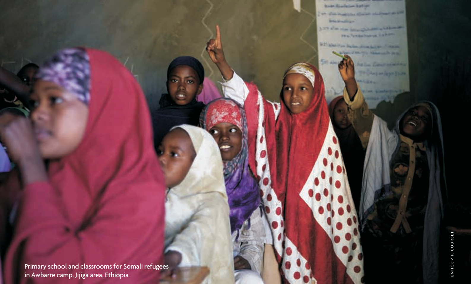
Primary school and classrooms for Somali refugees in Awbarre camp, Jijiga area, Ethiopia