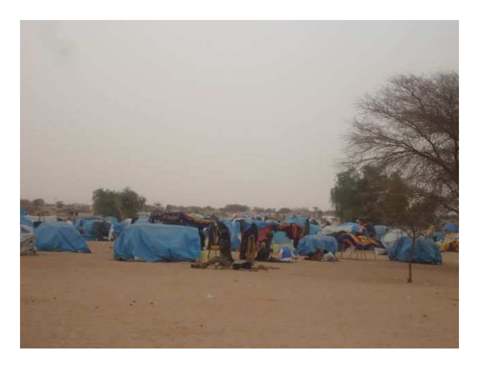
Mangaïze site, Ouallam Region, Niger.

At the end of April 2012, the Amnesty International delegation travelled to Niger to visit four Malian refugee sites: Gaoudel, Mbaïdou and Tinfaguate, in the Ayorou region and Mangaïze, in the Ouallam region.]