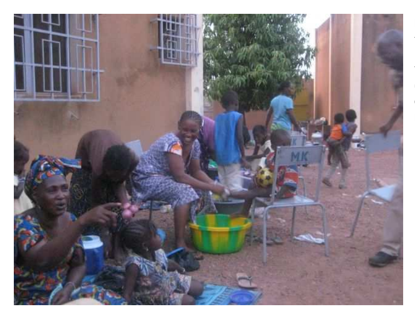
Displaced women at the Shelter Centre for members of the Timbuktu Baptist Church, in Bamako.

In January 2012, a new rebellion was launched under the leadership of two armed groups made up, in particular, of the heavily armed Tuareg fighters returned from Libya after the fall of President Gaddafi – the Azawad National Liberation Movement (Mouvement national de liberation de l'Azawad, (MNLA)) and Ansar Eddin (see box 2.2). There were serious clashes between these armed groups and the Malian soldiers, resulting in the death of dozens of fighters on both sides. Some Malian soldiers were killed and their throats slit after having been taken prisoner. This fighting caused tens of thousands of people to flee towards the south of the country and to neighbouring countries.