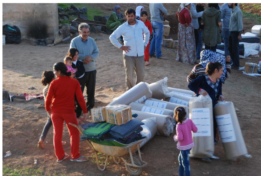
Syrian refugee family collecting mats and foam mattresses during distribution in Suruç Town.

On 03 November, UNHCR officially introduced Concern and ASAM as new Implementing Partners for core relief items distribution on the Suruç area to the humanitarian community and Turkish authorities. UNHCR has already begun to train the new implementing partners on distribution of relief items during emergencies.