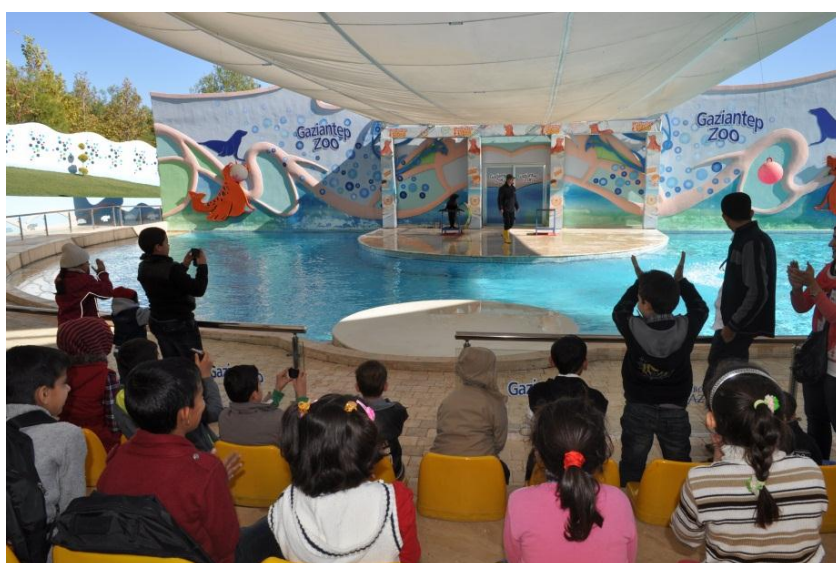
Syrian refugee children visiting the Gaziantep zoo on 05 November

As part of the UNHCR-funded Gaziantep Community Centre's programme for children's psychosocial activities, implementing partners IMC/ASAM promoted a visit to Gaziantep zoo for a group of 34 Syrian urban refugee children from Gaziantep. The center's psychologist explained that this initiative aims to increase the children's sensitivity to their surroundings, teach them how to act as part of a group and to take care of each other. Many children took part together with their younger or older siblings. Educational and psychosocial activities are extremely important to create a sense of normalcy, promote social interaction and break the monotony of life in asylum.