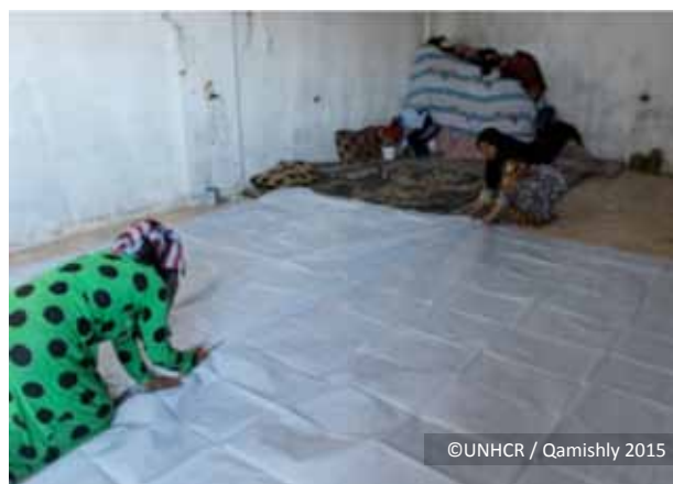
Qamishly 2015