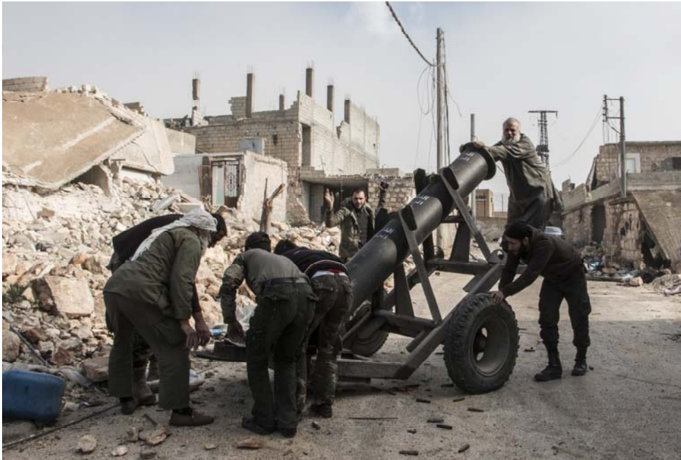
A group of armed opposition fighters preparing a “hell cannon”, which was made locally. Opposition fighters in Aleppo have created their own rockets and their own launchers. 22 November 2014

The “hell cannon” is an improvised explosive device (IED) reported to have been first built by the armed opposition group Ahrar al-Shamal in 2013. The cannon barrel is usually around three feet long and mounted on wheels. The projectile is a re-purposed propane gas canister, which is filled with explosives and shrapnel. The typical hell cannon can fire more than 15 types of shells that weigh more than 40 kilograms and has a range of 1.5 kilometres. The hell cannon is just one of a variety of IEDs that have been developed by armed opposition groups during the conflict in Syria. It continues to be a popular choice with armed opposition forces and dozens of videos showing it in action have been posted online. 107