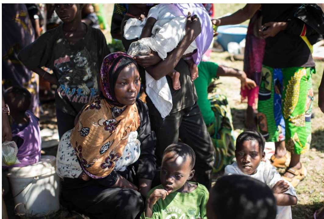
A mother rests with her children on the shore of Lake Tanganyika in the Democratic Republic of Congo after a grueling 22-hour boat journey to reach safety.