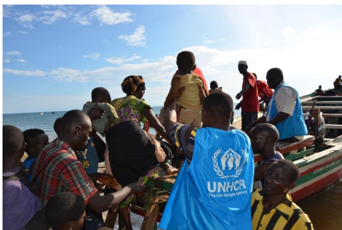
UNHCR assists a child board one of the small fishing boats used to ferry refugees to a ship that will then transport them to Kigoma.