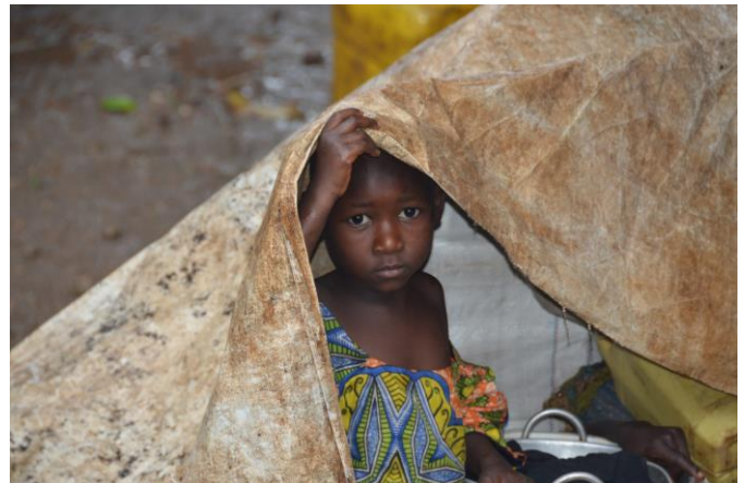
A young child in Kagunga waiting to be transferred to Kigoma and then onwards to Nyarugusu camp.