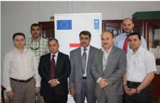
Representatives of UNDP-Iraq and other partners supporting the Court in Erbil.

Reduced access to justice severely impacts on communities, especially women and the most vulnerable. The latter have limited access to the formal justice system and little confidence in its workings, often relying on traditional justice mechanisms instead. While these play an important role in promoting social reconciliation, they are often not compliant with national and international human rights standards.