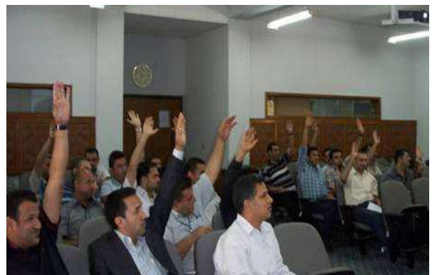
Iraqis participate in a training course on urban planning and local economic development.

Key planning staff are keen to apply lessons more holistically and UN-HABITAT is considering implementing a programme that will upgrade the training for planners within the tertiary education sector. At the same time, establishing a more proactive professional institute for planners in Iraq providing short courses, networking and learning exchange and formal courses of study is under consideration. ■