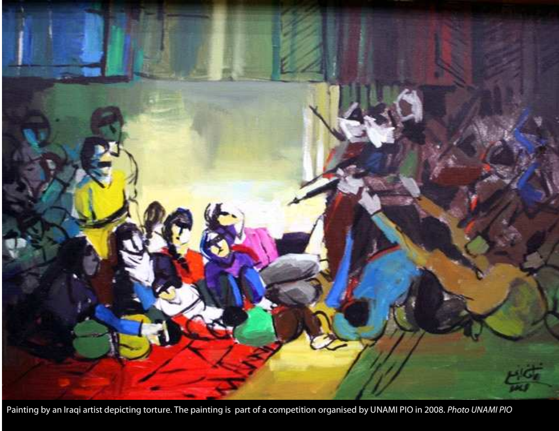
Painting by an Iraqi artist depicting torture. The painting is part of a competition organised by UNAMI PIO in 2008.