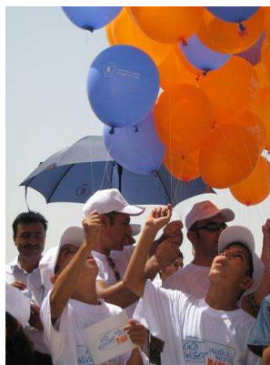
Launching balloons after the Walk.