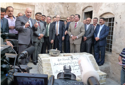
Governor of Erbil, Nawzad Hadi, talks to the press following the ceremony at the Erbil Citadel.