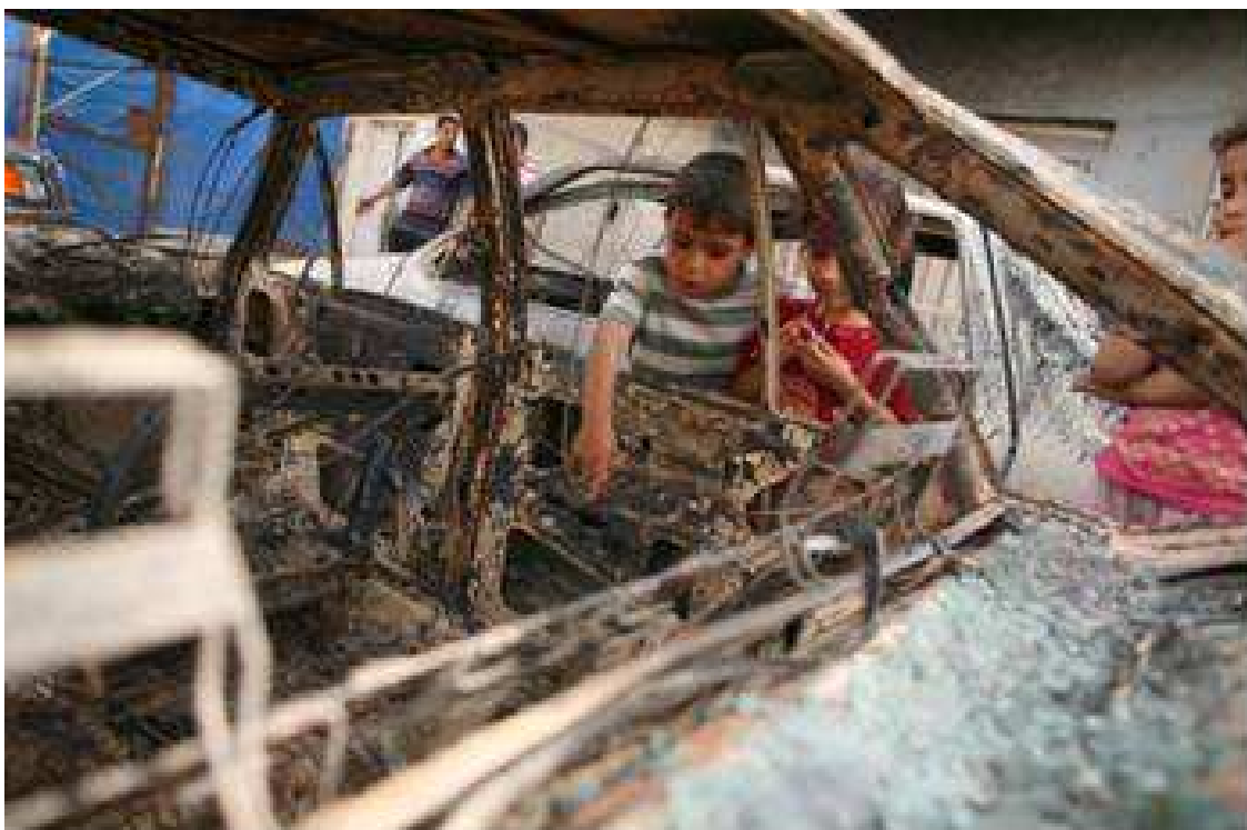
Children peering into the shell of a bombed car.

International Committee of the Red Cross