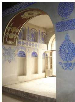
Inside Erbil citadel