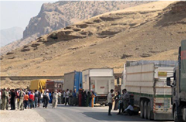
IOM trucks carrying aid kits being offloaded in Sangasar.

For more information, please contact Antonio Salanga: asalanga@iom.int