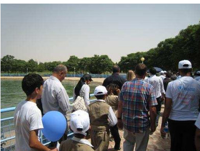
Walk participants at the Sami Abdulrahman Park in Erbil.