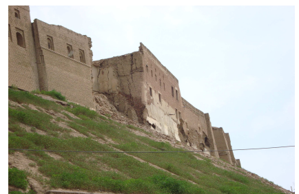
View of Erbil Citadel