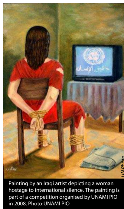
Painting by an Iraqi artist depicting a woman hostage to international silence. The painting is part of a competition organised by UNAMI PIO in 2008.