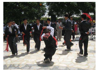
Traditional Kurdish dancers perform at the event.