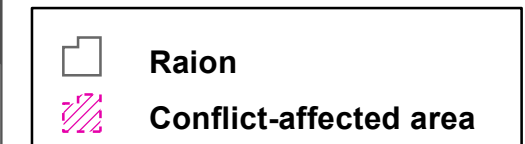
Ukraine: Health severity by raion: Humanitarian Situation Monitoring (round 3) - December 2014