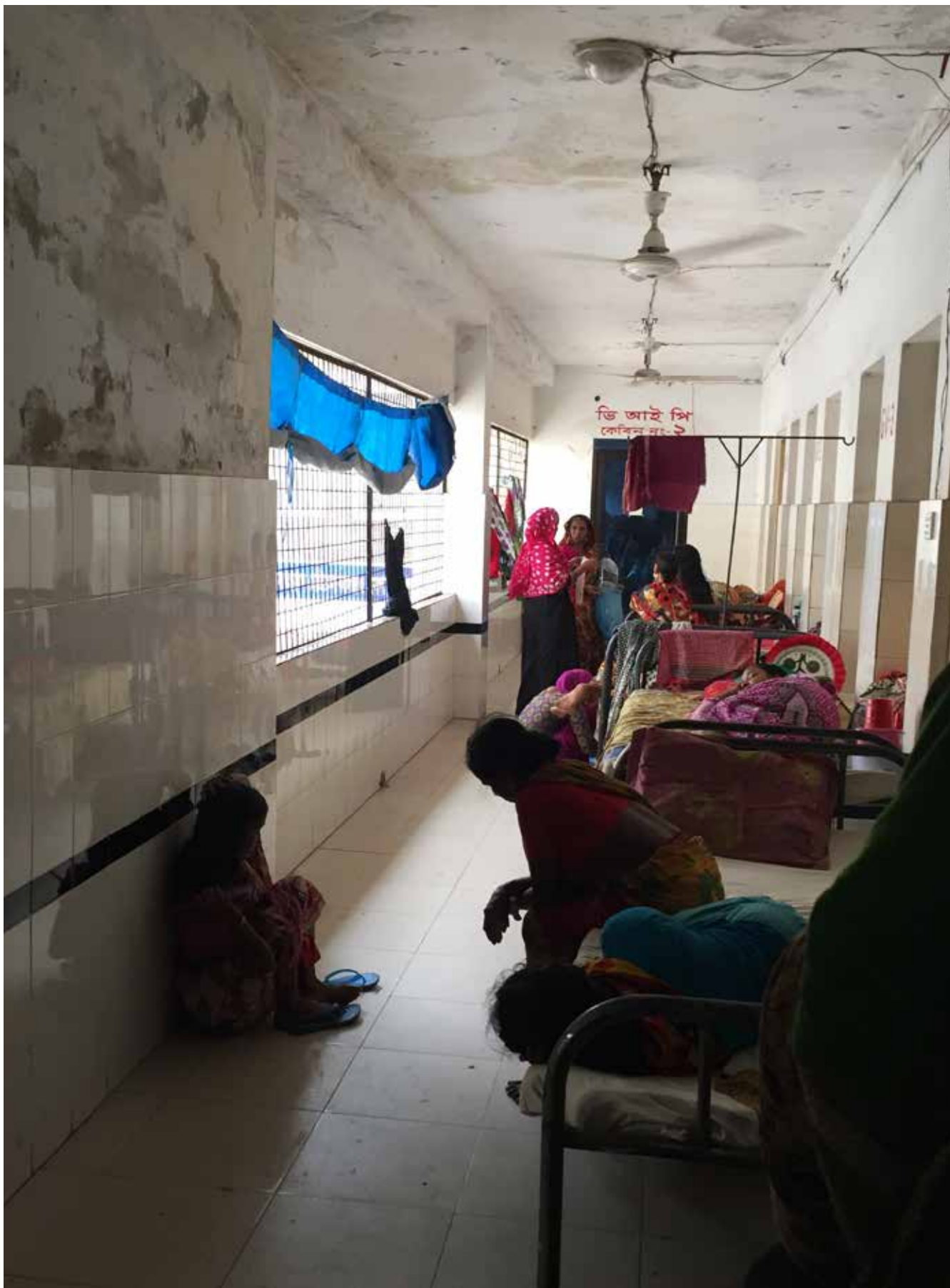
Women's ward of the hospital in Gazipur, Bangladesh