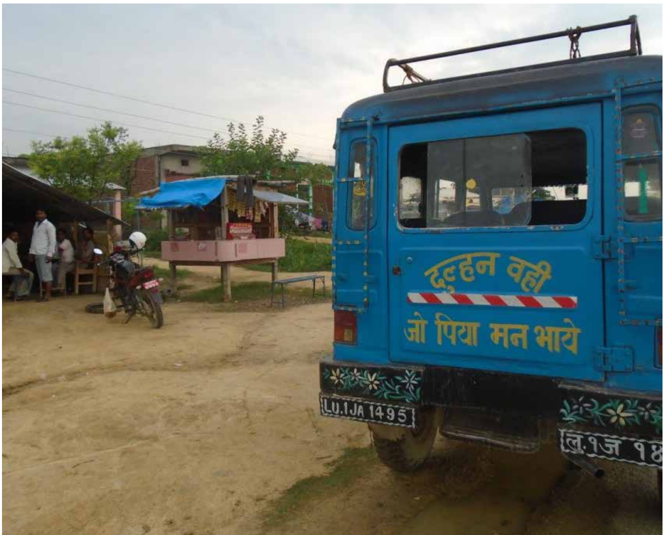
The bumper sticker on this Nepali van reads: 'Good wife is someone whom the husband likes'.

Similarly, in Bangladesh, some women believe that beating a woman is justified if she goes out without her husband's permission (in-depth interview with survivor), does not take care of the children (in-depth interview with