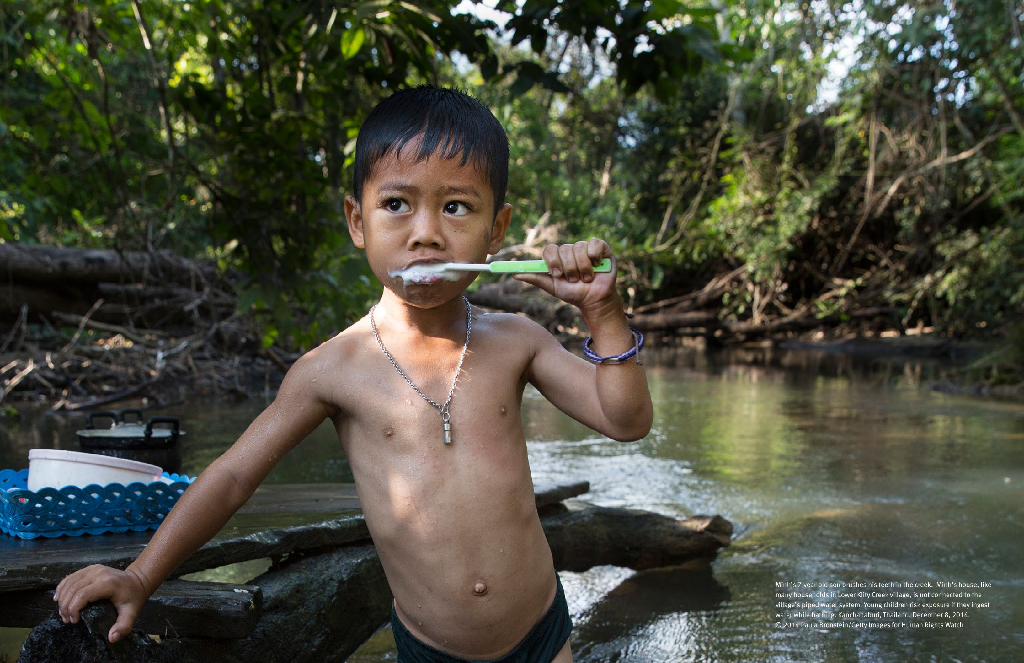
Minh's 7-year-old son brushes his teeth in the creek. Minh's house, like many households in Lower Klity Creek village, is not connected to the village's piped water system. Young children risk exposure if they ingest water while bathing. Kanchanaburi, Thailand. December 8, 2014.