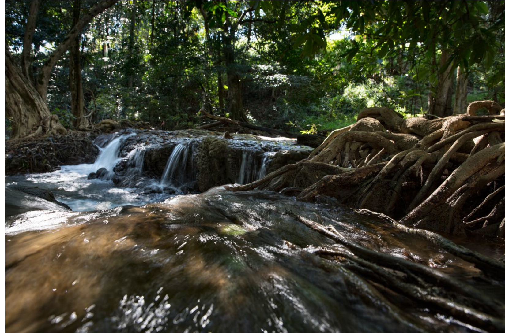
Klity Creek. Kanchanaburi, Thailand. December 8, 2014.