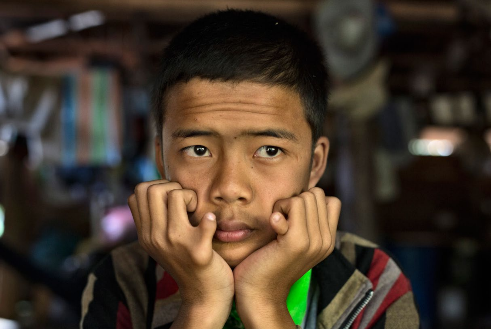
Chanthira's 15-year-old son has an extra finger on each hand and an extra toe on each foot. Kanchanaburi, Thailand. December 7, 2014.