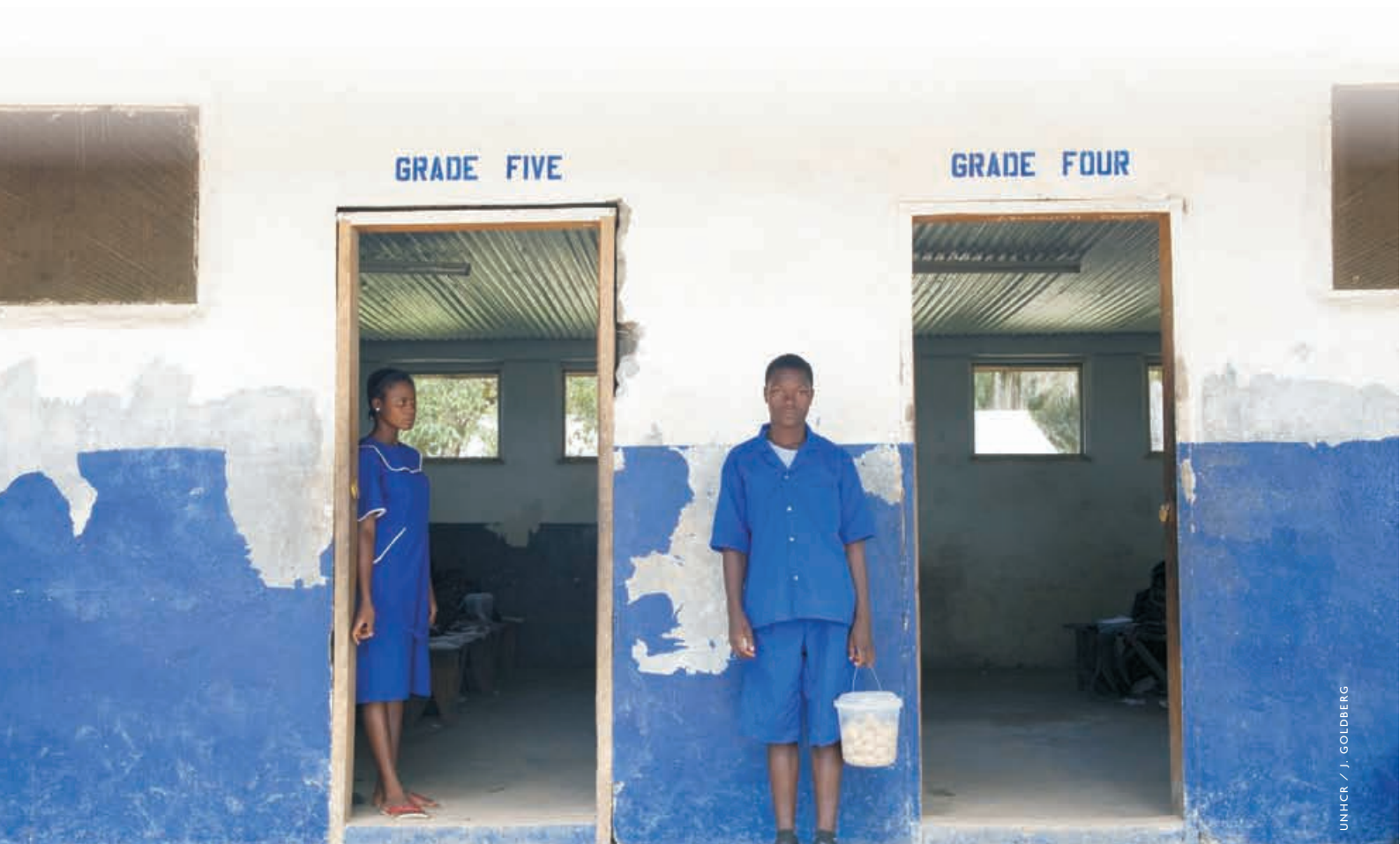
Liberian returnees go to school in Voinjama

Community services: Social and recreational clubs for children were established in Saclepea refugee camp. Recreational activities were used to disseminate information on HIV and AIDS prevention. In addition, condoms were distributed to adult men and women. Three groups of peer educators were established in the camp for awareness and advocacy purposes. In Maryland County, some 30 graduates of sewing or blacksmithing courses received start-up kits.