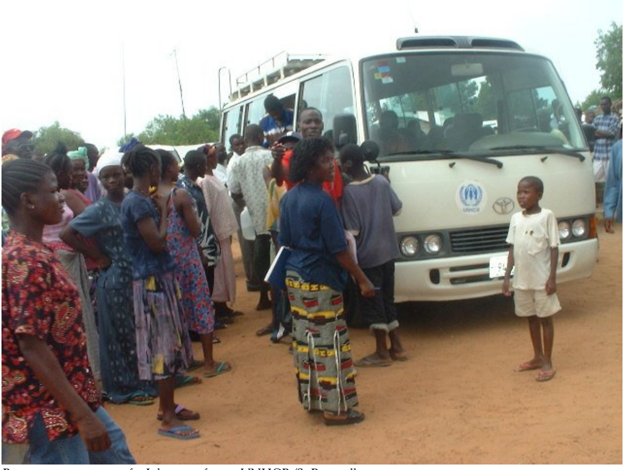
Repatriation operations for Liberian refugees.