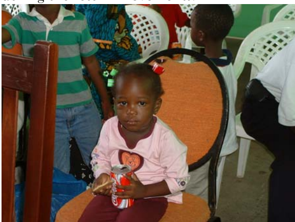
Child who received some food and a refreshment upon arrival.

88. At present 12 per cent of the assisted refugee population is considered vulnerable. Most of them are single parents, single females heads of household, chronically ill or separated children and/or unaccompanied minors. There are also significant numbers of physically disabled, unaccompanied elders, deaf/mute persons, and visually impaired individuals who will require special care during the return movements.