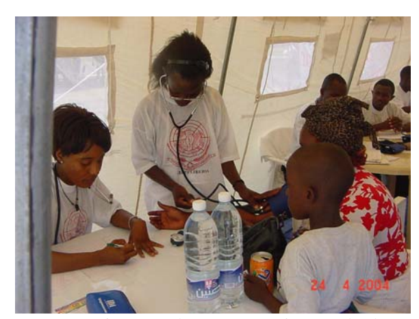
Returnees from Mali receiving free medical treatment upon arrival.