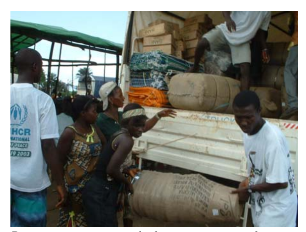
Returnees receiving non-food items upon arrival in Siegbeh returnee camp.