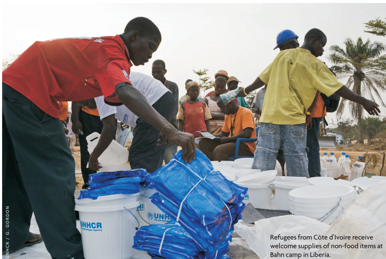
Refugees from Côte d'Ivoire receive welcome supplies of non-food items at Bahn camp in Liberia.