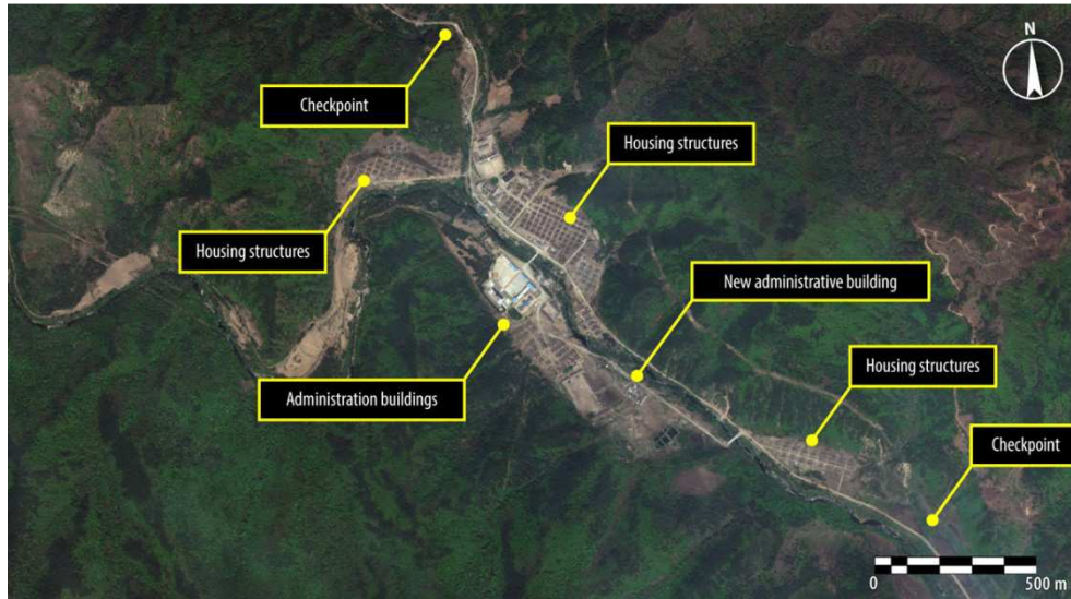
DigitalGlobe Natural Color Imagery, May 18, 2011 , 41.310814°, 129.346097°

The central (administrative) area of kwangiso 16 appears to have undergone the most change in the observation timeframe, including the razing and reconstruction of housing structures. In total, eight new housing structures were added in 2011 and 2012 (see bottom image), and a new administrative building was added in 2010 (see top image).