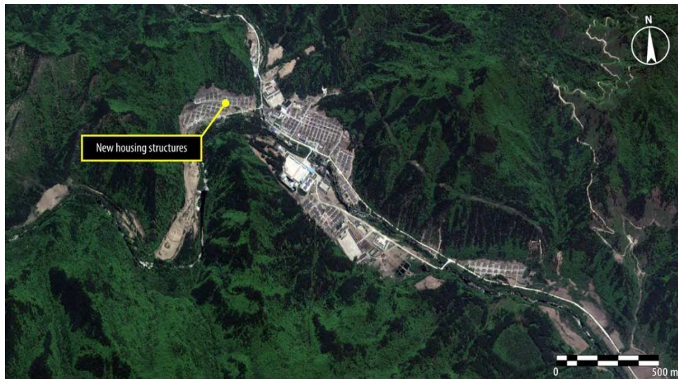
Natural Color Imagery, May 26, 2013, 41.310814°, 129.346097°