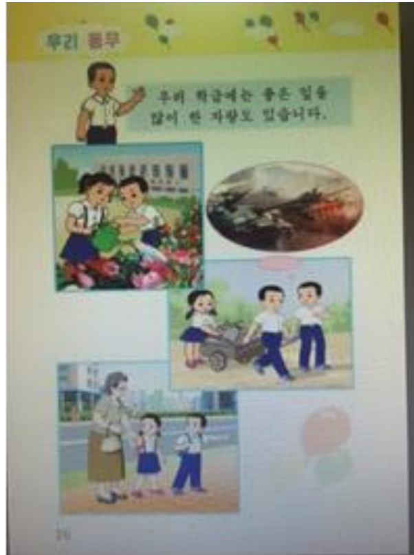
Image: Page from government textbook for 1 st grade students on Socialist Ethics published in July 2013, extolling children who perform labor to collect scrap metal to provide to the school [Image Courtesy of New Korea].