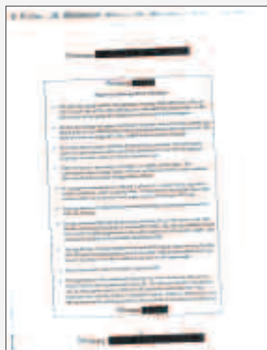
Report of the Central Intelligence Agency, inspector general, “Counterterrorism Detention and Interrogation Activities (September 2001 – October 2003) (2003-7123-IG),” May 7, 2004, p. 15.