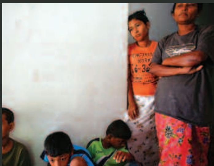
Rohingya women and children who arrived by boat from Burma pass the time at a closed shelter in Phang Nga, Thailand, in October 2013.

Children should not lose any of their childhood in immigration detention. Alternatives to detention exist and are used effectively in other countries, such as open reception centers and conditional release programs. Such programs, generally a cheaper option, respect children’s rights and protect their future. Given the serious risks of permanent harm from depriving children of liberty, Thailand should immediately cease detention of children because of their immigration status.