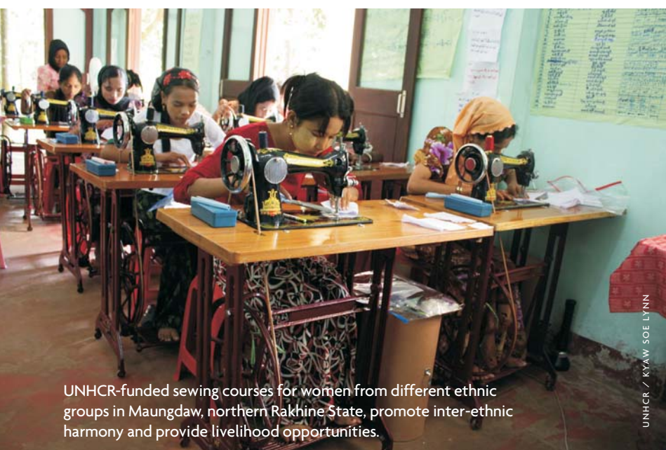
UNHCR-funded sewing courses for women from different ethnic groups in Maungdaw, northern Rakhine State, promote inter-ethnic harmony and provide livelihood opportunities.