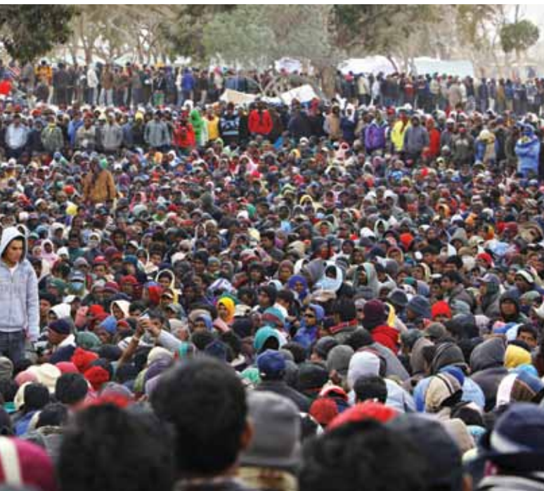
A Tunisian man hands back passports to Bangladeshi refugees that were collected by the Tunisian military at the time of crossing the border.

'subsidiary protection' regime. However, it is worth noting that the principle of non-refoulement is now so widely accepted that it is considered a principle of customary international law; the obligation not to return persons to harm is therefore binding on all states, including those not party to any of the relevant treaties.