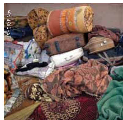
Sallum border post in the no-man's land between Libya and Egypt.

The social and political unrest and the popular push towards more democratic governance in North Africa have upset the cosy relationship and collaboration on migration issues between European and North African governments. In the years preceding the revolutions, the EU and its North African counterparts thought that the problem of the crossing of the external borders of Europe by ‘undesirables’ was, if not solved, at least beginning to be overcome. In addition to increasingly restrictive immigration regimes, the EU externalised border controls to North African countries through initiatives such as the bilateral agreements between the former Libyan regime and Italy, or Tunisia and France, or Morocco and Spain. Rather than stopping migration, this has increased the irregular character of migration and has led to a geographical diversification of overland and maritime migration routes in and from Africa. This has made migration more costly and risky for migrants, and increased their