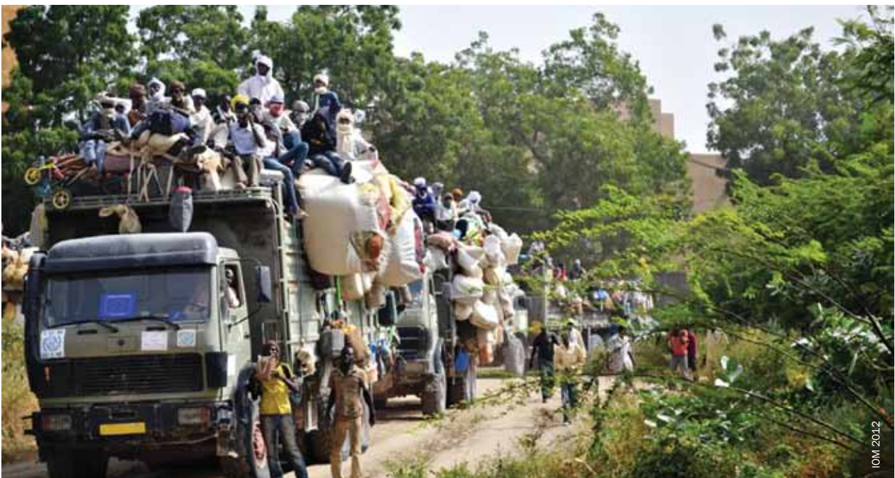
Returnee migrants from Libya to Chad

The return and reception of migrants appears to have been systematically organised across the countries of West Africa but measures faltered, perhaps inevitably given the circumstances, when it came to reintegration support. In terms of reception, the approach in Senegal seems typical of other countries in the region. The government mobilised a national committee with the help of IOM and other agencies to plan a response. This involved