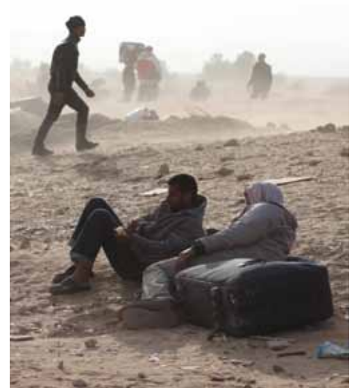
Front cover image: On the Tunisia-Libya border 2011