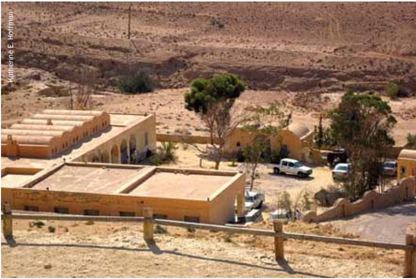
Youth hostel in Douiret, Tunisia, converted for use by Libyan refugee families.

least 40,000, and could I help? So I called all my friends, we had a meeting, and we raised money and we bought food, diapers and mattresses, loaded up twenty pick-up trucks, and headed to the border to deliver everything. After that we went down to where people from the Nafusa Mountains were coming in. There everyone is Amazigh [Berber]. They're Amazigh, we're Amazigh."