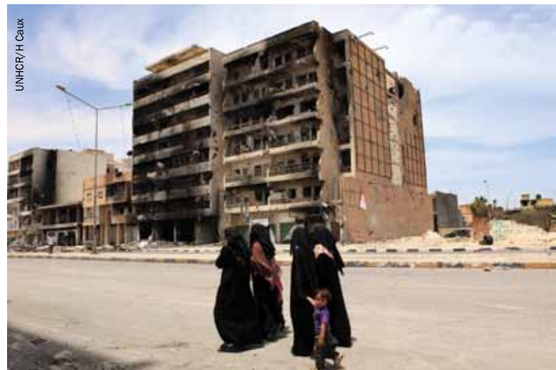
Tripoli Street, Misrata.

In the meantime, the most obvious problems relate to IDP camps, which have typically been established on the sites of half-finished construction projects, as well as in public buildings and resort villages. The lack of any clear legal basis for occupation of these sites presents clear risks to residents, especially where such sites may be subject to claims by foreign companies returning to Libya. As a result of this lack