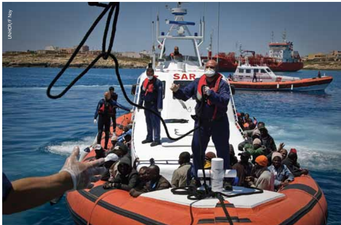
An Italian coastguard vessel prepares to dock in Lampedusa's port, carrying people who had been rescued before their boat sank at sea.

Italy's policy of (non-)reception should be considered alongside its policy of maritime border patrols in the Mediterranean. Patrolling, rescue and send-back policies have all been conducted with the intention of preventing and/or reducing unwanted influxes as much as possible. The 2008 Friendship Agreement with Libya