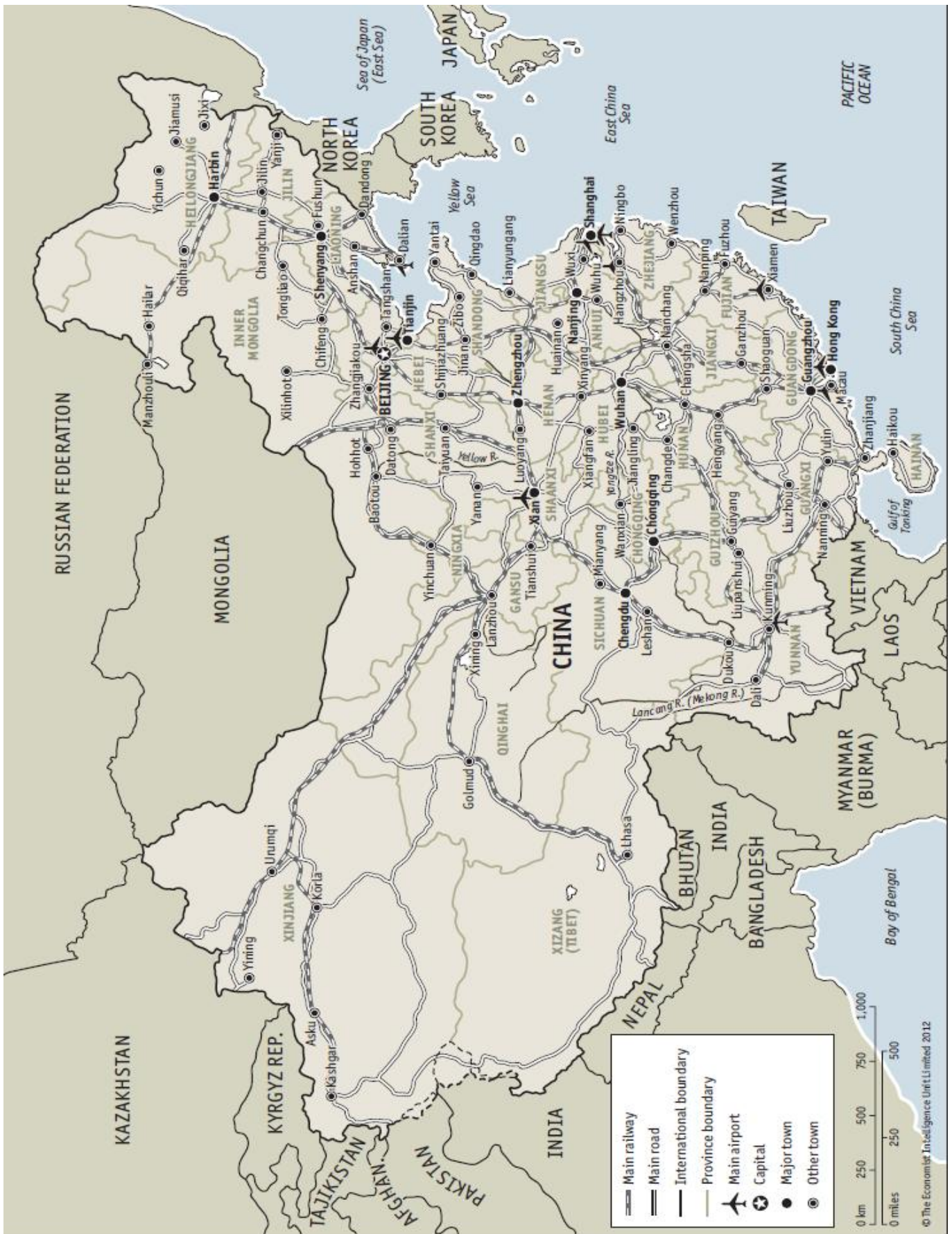
[4b] (p2) (The Economist Intelligence Unit, Country Report, September 2012)