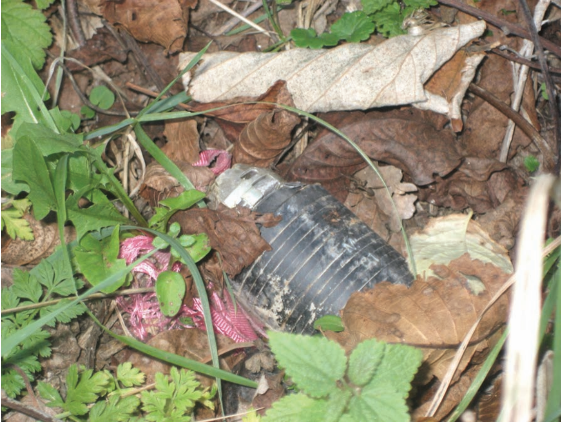
An unexploded M85, an anti-personnel and anti-armor submunition found in Shindisi in October 2008. M85s caused civilian deaths and injuries in Shindisi both at the time of attack and afterwards. Bought from Israel and launched by Georgia, this submunition is carried in an Mk-4 160 mm rocket.

which they brought back to the village. When they tried to disassemble it the submunition exploded, killing Ramaz Arabashvili, age around 40, and wounding four others. 182