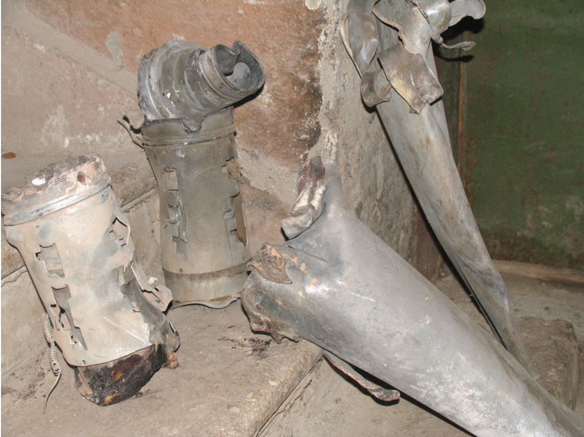
Components of BM-21 Grad rockets recovered in an apartment building in Tskhinvali.

The above are only a few of the examples of damage caused to the South Ossetian capital by Grad attacks.