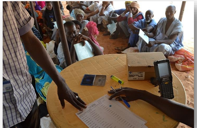
General Food Distribution in Mberra Camp.