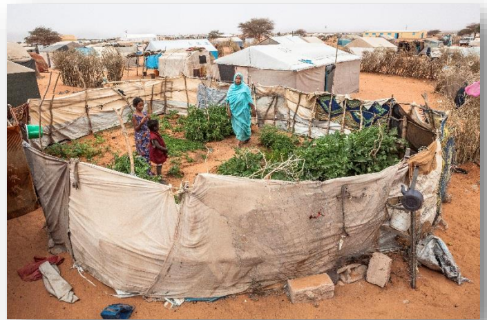
Gardening at a household in Mberra Camp.