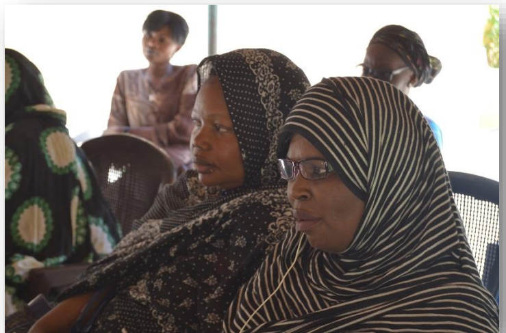
Urban Refugees meet at the Refugee Women Center in Nouakchott