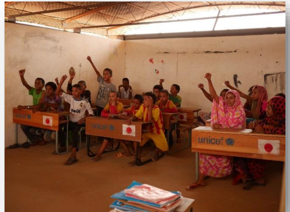
A classroom in Mberra Camp.