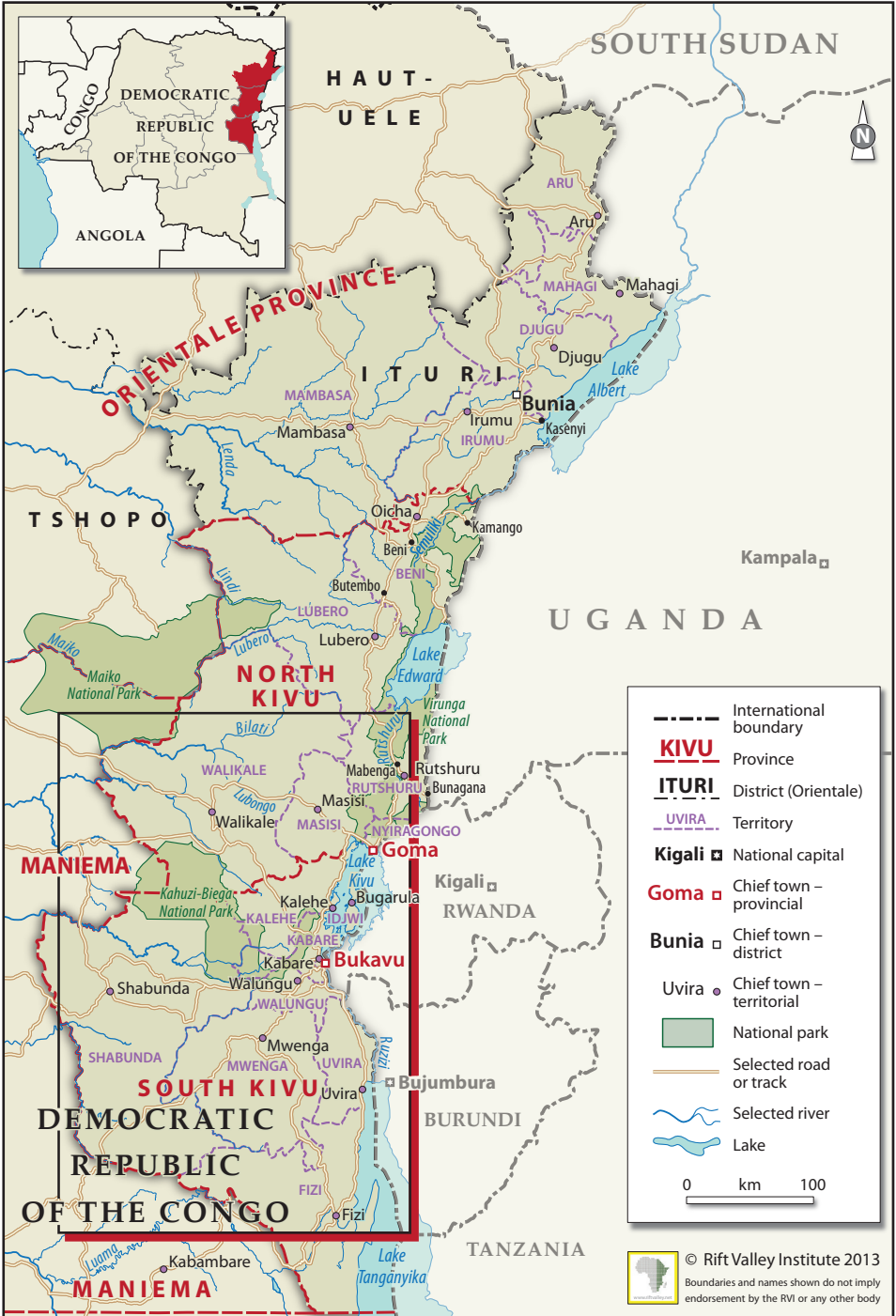
Map 1. The eastern DRC, showing area of detailed map on following page