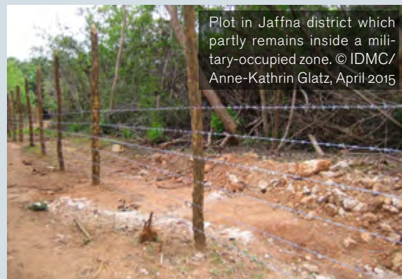
Plot in Jaffna district which partly remains inside a military-occupied zone. © IDMC/ Anne-Kathrin Glatz, April 2015

In Sampur in Trincomalee district, eight hundred and eighteen acres belonging to 246 families are part of a Special Zone for Heavy Industry set up by the Board of Investment in 2012, while 234 acres belonging to 579 families are occupied by the Sri Lanka Navy. Both areas were originally scheduled to be released in April 2015, but the process has been delayed. 34 Interviewees raised concerns about the health risks of returning to live in the area next to the reduced special zone once a planned coal-fired power plant is operational there. No houses or infrastructure remain in the special zone, but there are intact houses and a school in the Navy-occupied area. Roads, electricity, water supplies and healthcare facilities need to be rebuilt. 35