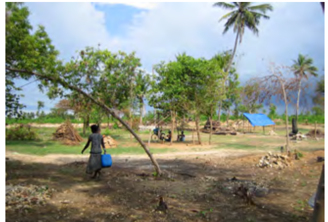
IDPs returning after 25 years in displacement are clearing their land in Jaffna district.

The new government has taken a different approach. In June 2015 the NGO secretariat, which previously came under the Ministry of Defence, was moved under the Ministry of Policy Planning. 19 The Ministry of Resettlement and the Resettlement Authority have begun to develop a return plan for areas recently released from military occupation as well as a durable solutions strategy. Facing a budget crisis 20 , the government needs the support of international organisations and donors in order to implement the plan.