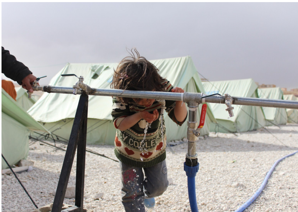
A child accessing a water point in the temporary shelter site, Aarsal.

35,000 residents of Aarsal + 20,000 registered refugees* + 20,000 refugees registered with the local municipality = 75,000 total population in Aarsal