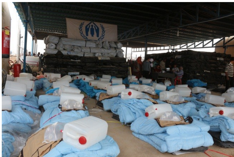
Distribution of Winterization items in Domiz Camp, Dohuk in the Kurdistan Region of Iraq.