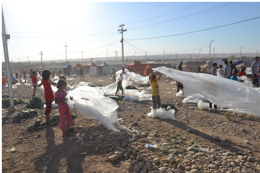
Children playing with plastic sheets following ACTED/UNHCR distribution of core relief items in Kawergosk camp, northern Iraq.