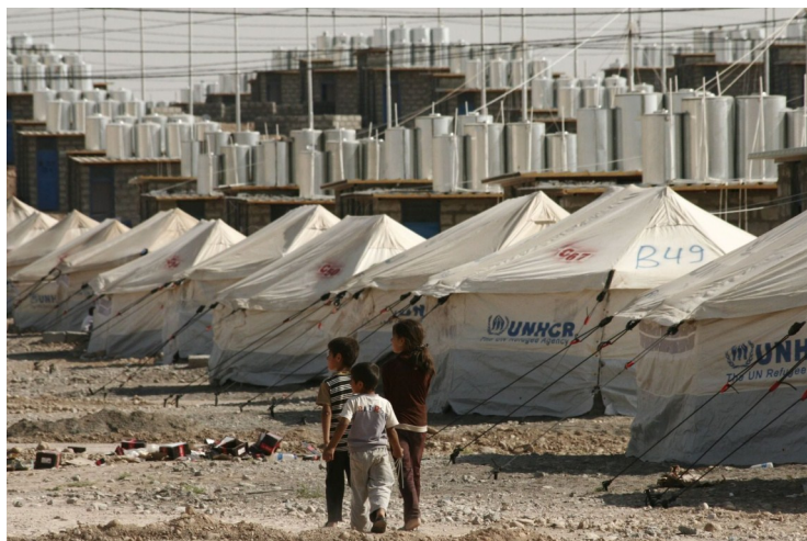
Darashakran camp in the Kurdistan Region, Northern Iraq.