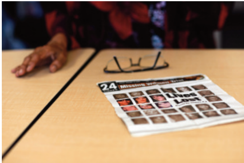
A woman shows a paper she has kept displaying the photos of women, some of whom she knew, who disappeared from the downtown eastside of Vancouver, British Columbia, in the 1990s.