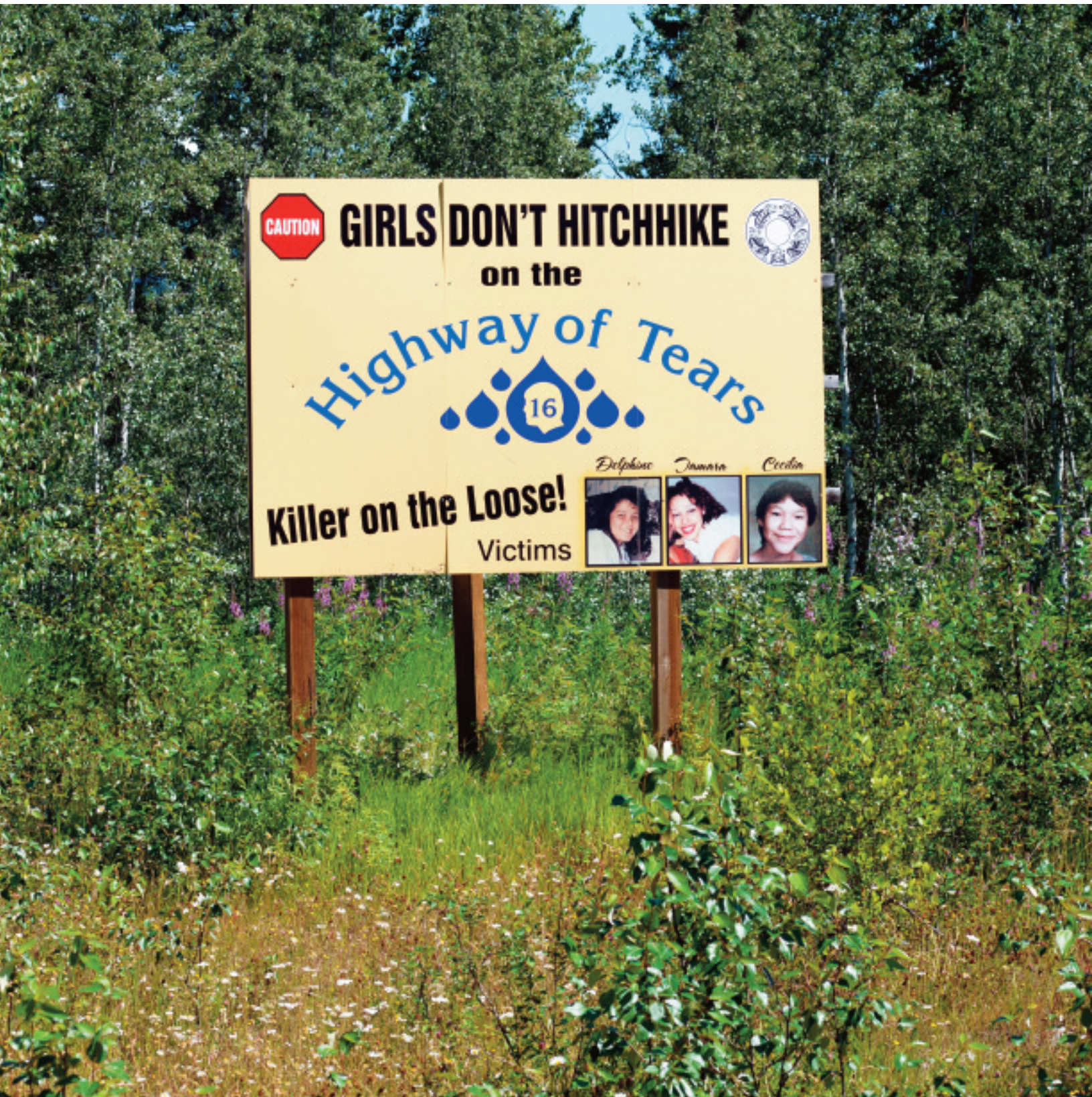
In northern British Columbia, a highway sign warns girls of the dangers of hitchhiking along the Highway of Tears.