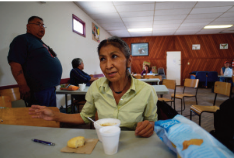
In Terrace, British Columbia, a woman discusses how police told her it was “too early” for them to do anything when she reported that her grandniece (whom she considers her granddaughter) had been missing for 14 hours. She said she told the police: “There are enough girls missing out there already, I want to know where my granddaughter is.”