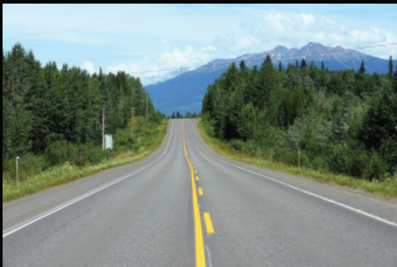
Highway 16, sometimes referred to as “the Highway of Tears” in recognition of the women and girls who have gone missing or been murdered in its vicinity, in northern British Columbia. July 2012.

To address the high levels of violence against indigenous women and girls, Canada should establish an inclusive national public commission of inquiry into the murders and disappearances of indigenous women and girls. British Columbia should expand the mandate of the civilian Independent Investigations Office to include authority to investigate allegations of sexual assault by police. Among other steps, the RCMP, in cooperation with indigenous communities, should expand training for police officers to counter racism and sexism in the treatment of indigenous women and girls.