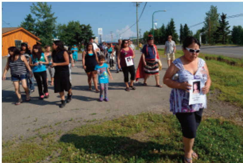
Community members participate in a spirit healing walk in Burns Lake, British Columbia, in remembrance of missing and murdered women.