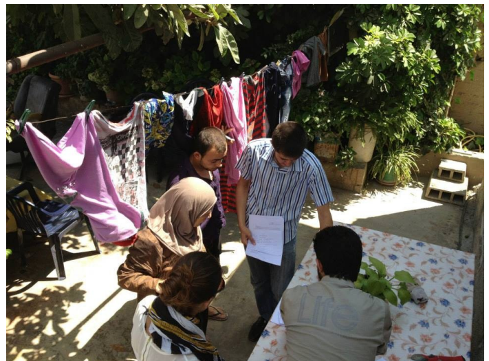
A Lebanese family that is hosting an elderly Syrian woman.