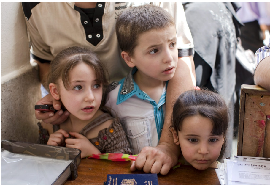
Three Syrian siblings from Damascus registering with UNHCR in Zamalek, Cairo.