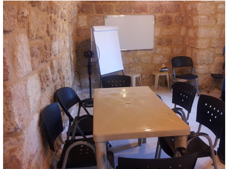
The vocational training and education centre in Beddawi, North Lebanon.