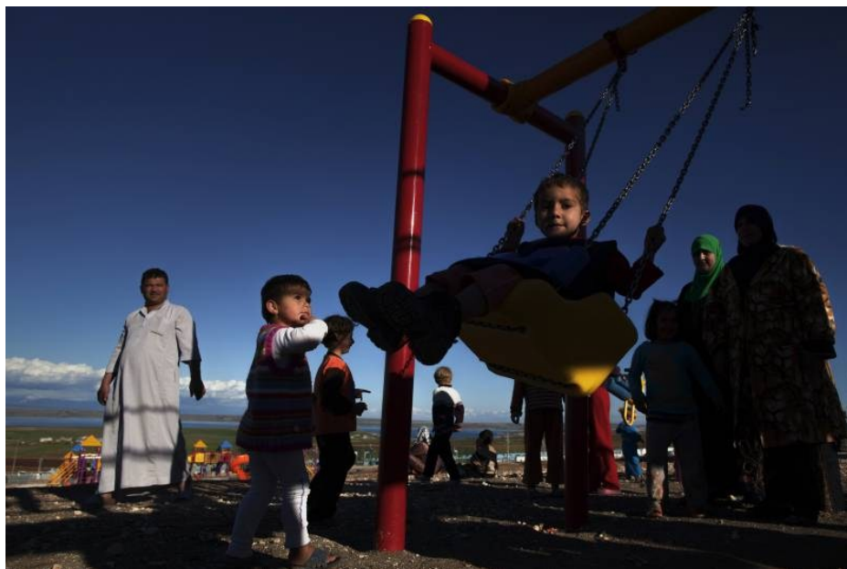
A Syrian child plays on a swing in a playground area established in Adiyaman refugee camp, Turkey. The services provided at the camp address both the physical and psychosocial needs of the refugees.