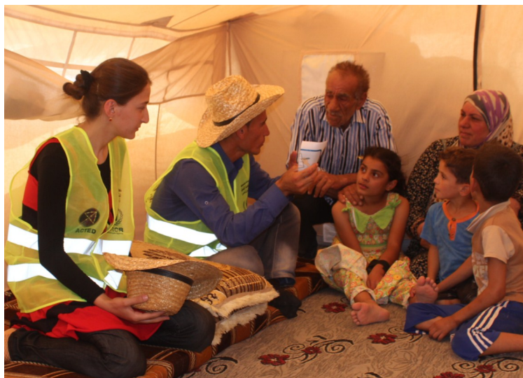
Outreach workers informing a newly arrived family and distributing brochures.