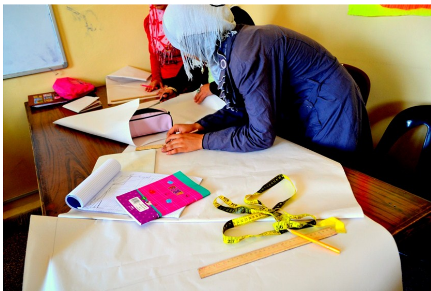
Sewing workshop at the Halba Community Centre, North Lebanon.