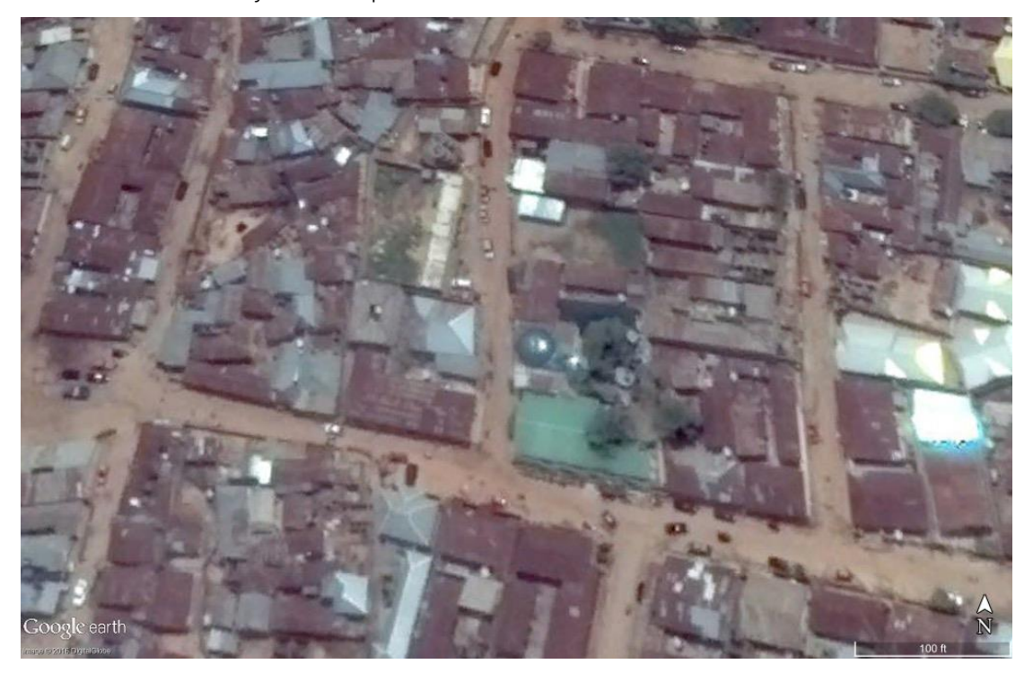
Satellite image of Al-Zakzaky's compound, Zaria, before destruction. Image date: 16 July 2015.

According to the testimonies received by Amnesty International, the soldiers approached the compound on the morning of 13 December and those who were killed during that day were mostly shot at from a relatively short distance and in broad daylight. Among them were several groups of siblings and relatives. Some had reportedly received non-life threatening injuries and are believed to have died when the makeshift medical facility in the compound was attacked and burned down.