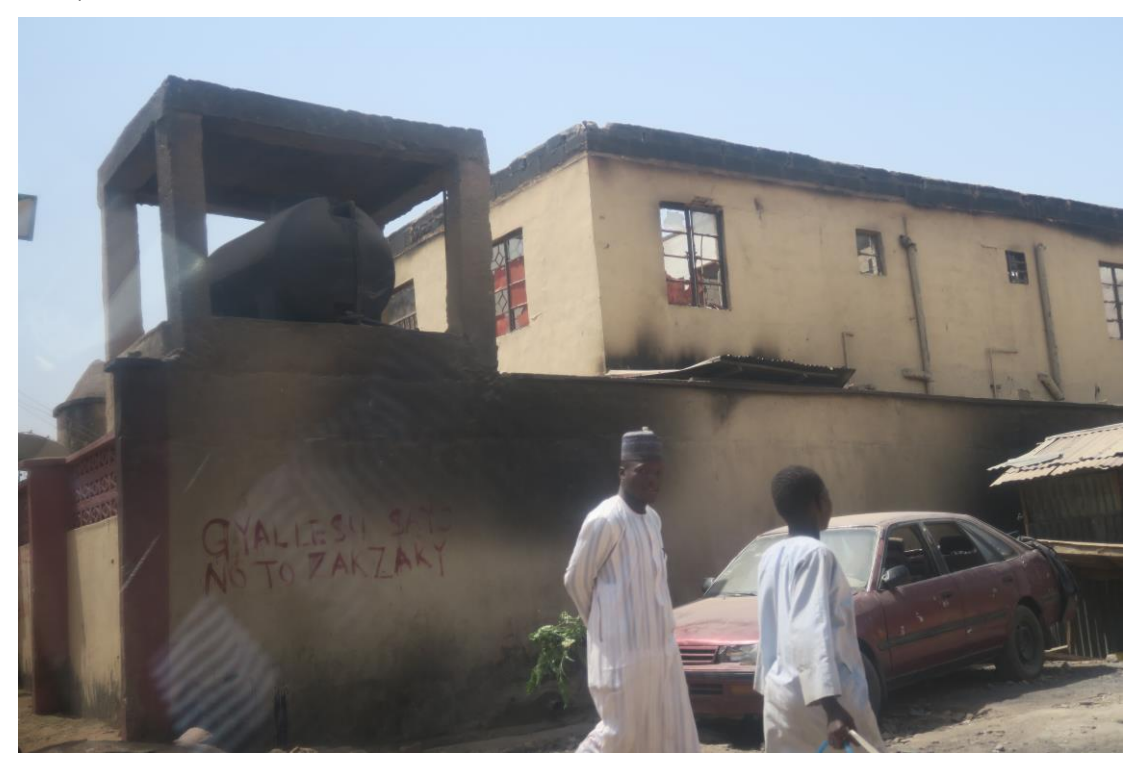
🖗 🐘 Anti Zakzaky graffiti on burned down building in Gyallesu neighbourhood, Zaria

were killed by soldiers who opened fire on the Shi'ite faithful who were sheltering after the suicide attack. The suicide attack was later claimed by the Boko Haram armed group but the IMN leadership has accused the military of complicity.<sup>43</sup> Fears of further attacks, arising from these incidents, are widely cited by IMN leaders as a reason for having opposed the presence of the military near the IMN headquarters on 12 December 2015.