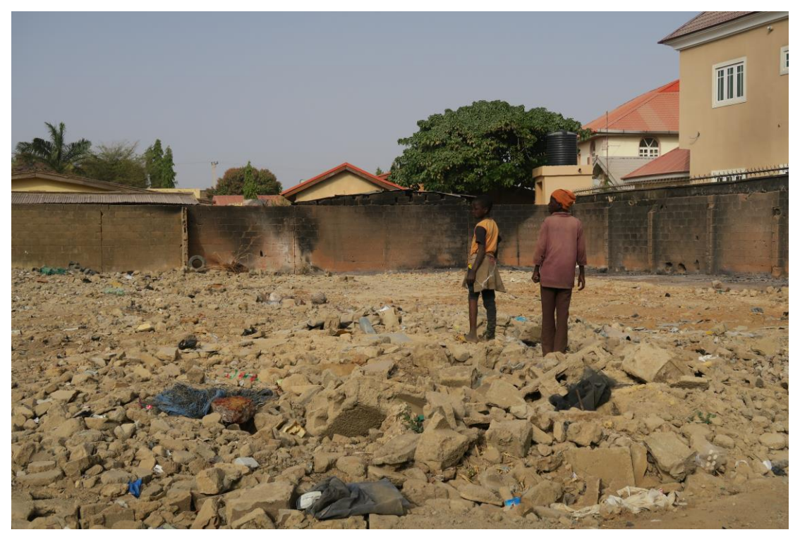
Burned down and demolished IMN Film Village - Editing Studios in Gyallesu neighbourhood, Zaria. Burn marks visible on the remaining walls

"Many of the Shi'ite were trying to run away and some run into neighbours' houses to hide but people rejected them for fear of getting into trouble with the army. Some people helped them out of humanity. The soldiers called on the residents, said if you are not Shi'ite come out and you will be ok. So the residents came out and were checked by the soldiers and then were let go. We had to leave the neighbourhood. So I don't know what happened after that".