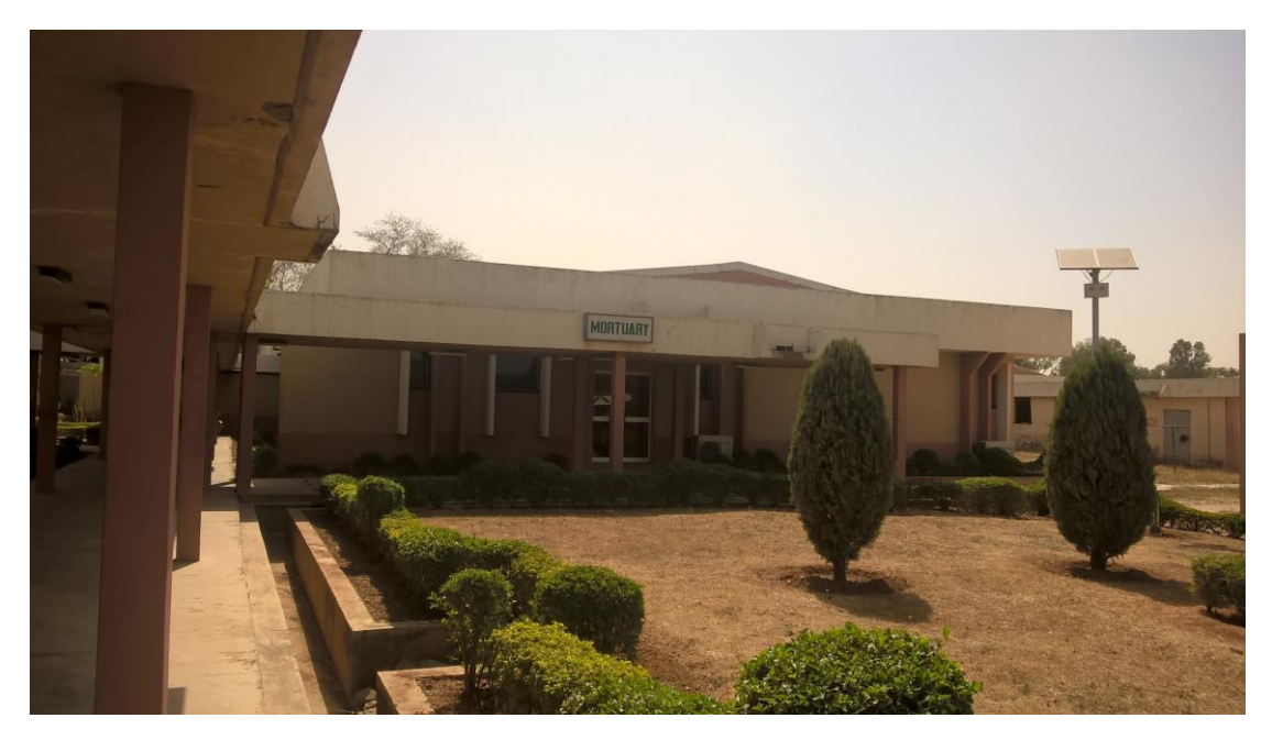
International Sello University Teaching Hospital's Mortuary, Zaria

A witness told Amnesty International that he saw a large numbers of bodies outside the hospital's mortuary on the evening of 14 December 2015, and another witness told Amnesty International that he saw several trucks and military vehicles diggings a large pit at the site of the suspected mass grave and unloading their cargo – which he said looked like a large number of bodies, before covering the pit with the dug-out soil.