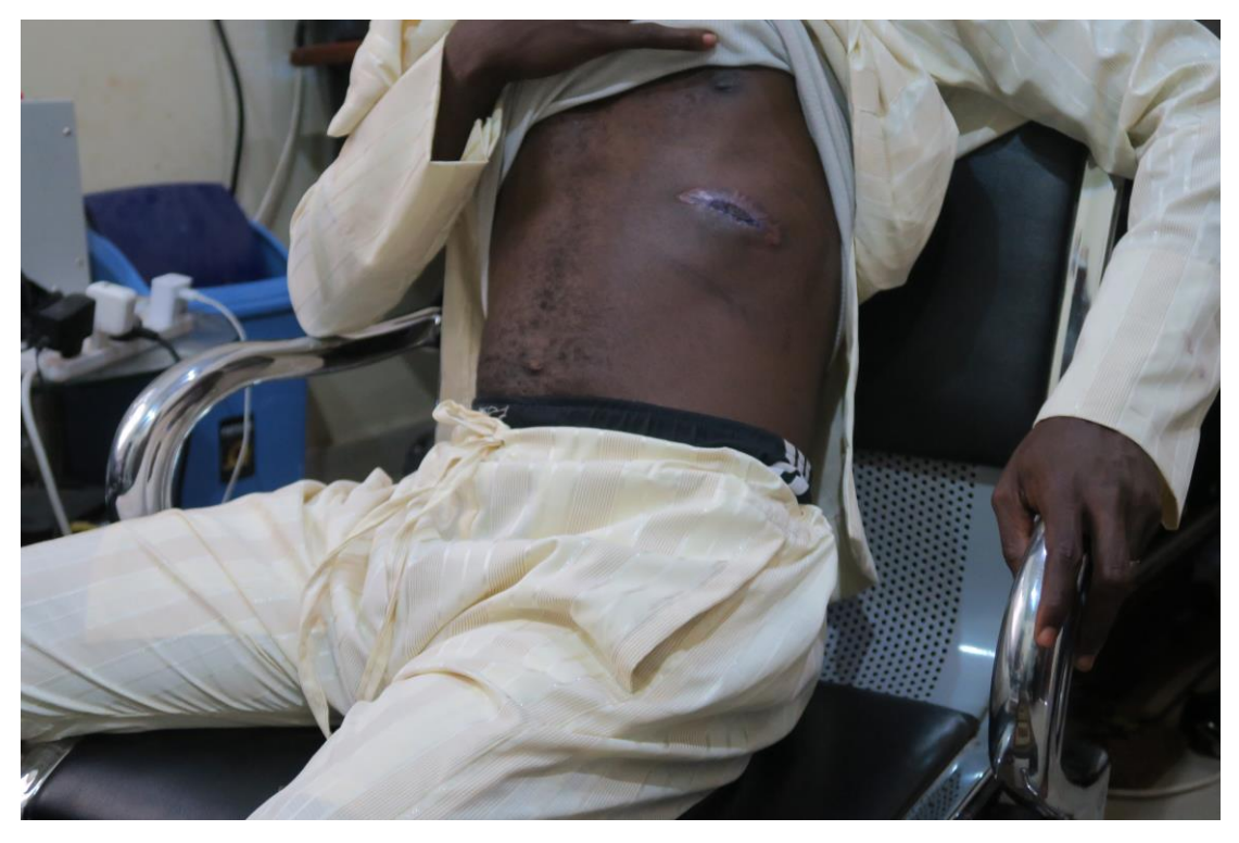
International Wounded protester, Zaria

Amnesty International has not had access to those who remained detained but has received information from medical sources that some of the detainees were not allowed access to the necessary medical care for several weeks after their arrest. At least three detainees are reported to have died in custody, allegedly because they did not receive the necessary medical treatment for injuries sustained during the clashes.<sup>60</sup>