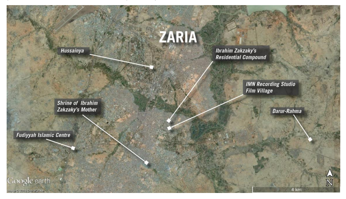
Sites of 12 – 14 December 2015 incidents, Zaria

This report documents one particularly egregious incident, unrelated to the conflict in northeast Nigeria, in which members of the Nigerian military unlawfully killed more than 350 men, women and children supporters of the Islamic Movement in Nigeria (IMN), a Shi'ite Muslim minority group. The killings took place in Zaria, 270km north of the capital Abuja, between 12 and 14 December 2015.<sup>3</sup>