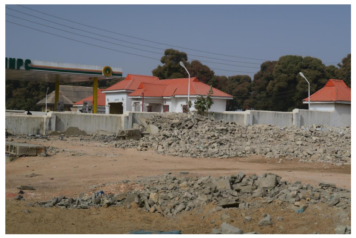
Destroyed buildings opposite the Hussainiya, Zaria

IMN protesters, mostly young men but also some women, are seen taunting - but not physically attacking – the army officers who walked into the crowd to ask protesters to clear the road and armed soldiers around them. Soldiers armed with assault rifles and other firearms are visible in significant numbers around the officers and the protesters.<sup>50</sup> The video then cuts to the time after the Chief of Army Staff's convoy has passed, briefly showing the road cleared of protesters, with some burning tyres on the empty road. The footage of the crucial moments, when, by the army's own admission, seven protesters were killed and some 10 wounded by the soldiers who moved in to clear the road, <sup>51</sup> is missing from the video.