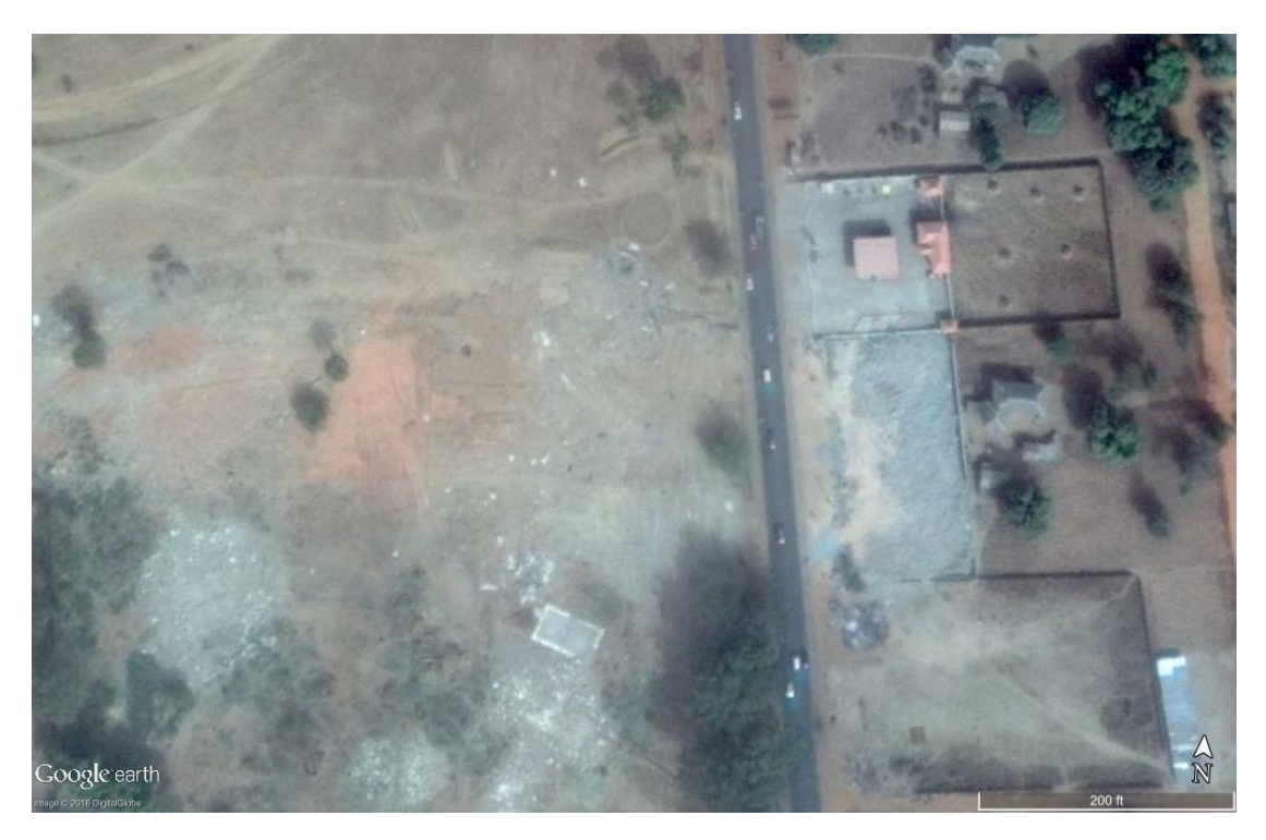
Satellite image of the Hussainiya, Zaria, after destruction. Image date: 30 December 2015