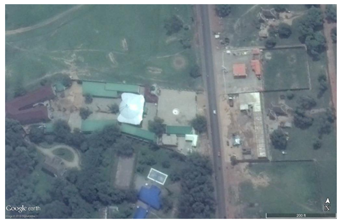
Satellite image of the Hussainiya, Zaria, before demolition. Image date: 16 July 2015

to clear the road and protesters refused. Video footage of the initial stage of the incident given to Amnesty International by the Nigerian military and available online shows IMN members – some carrying batons, knives and machetes – standing on the road and blocking it.