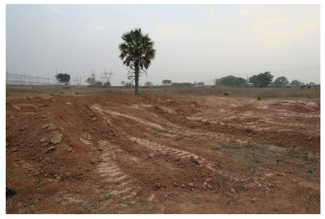
International Possible mass grave, Zaria - Close-up, bulldozer tracks visible

Amnesty International received numerous allegations that those killed during the incidents in Zaria were secretly buried in mass graves in the days after the incidents. Families of those confirmed killed and of those who have been missing since the incidents and presumed to also have been killed have endured untold anguish, not knowing if their loved ones have been buried and if so where.