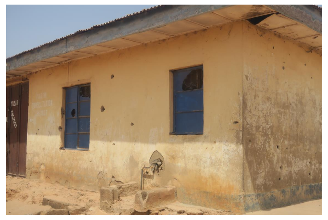
Bullet holes in houses near the compound of Ibrahim Al-Zakzaky in Gyallesu neighbourhood, Zaria

Video footage shot on mobile phones by IMN supporters or residents of the neighbourhood after the incident shows bodies of men with gunshot wounds and charred bodies strewn around the partly burned-down compound. The bodies appear to have been unarmed.