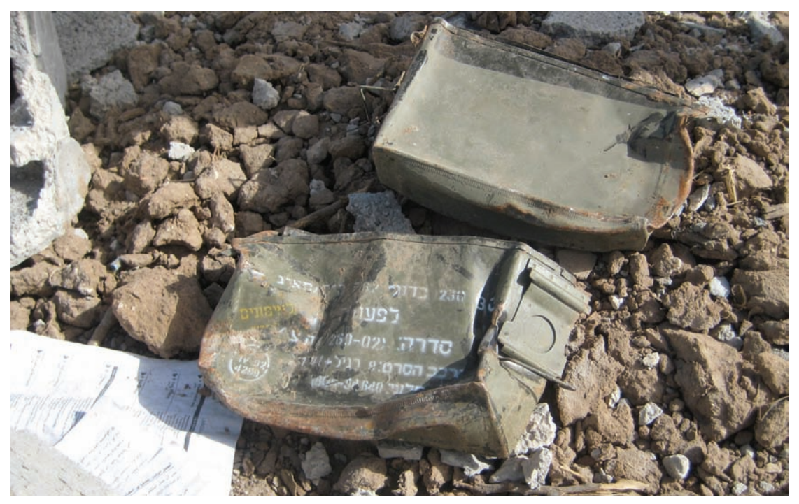
An ammunition box for 230 7.62 x 51mm bullets found outside Khalid 'Abd Rabbo's house in eastern Jabalya, where Khalid's two girls were shot and killed. The 7.62 bullet is fired from the FN MAG 58, a machinegun used by Israeli infantry troops and also mounted on tanks and armored personnel carriers.