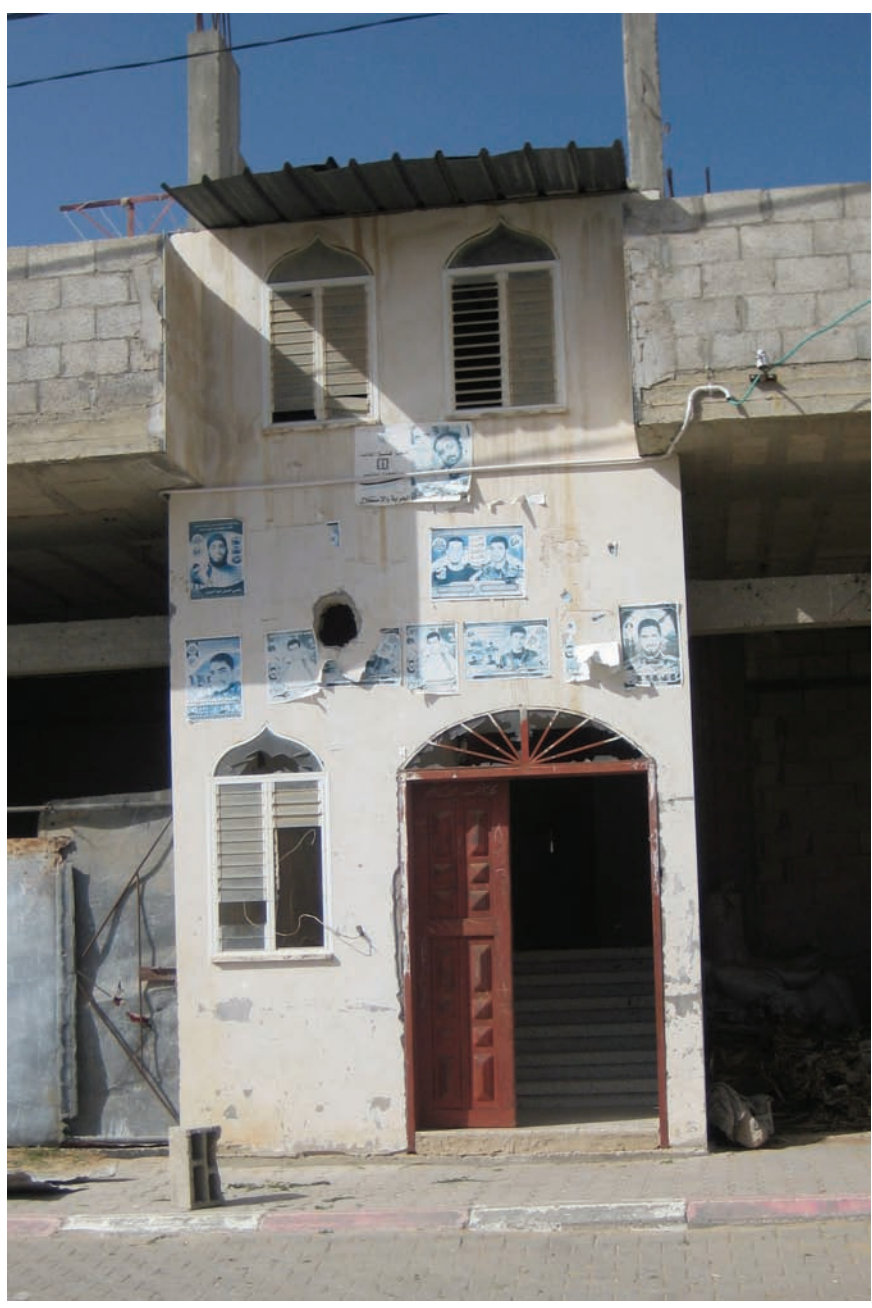
An Israeli soldier shot and killed Rawiya al-Najjar from this house in Khuza'a. Human Rights Watch found two sniper holes, Israeli food wrappers and Hebrew writing on the inside house wall that said "Observation Post 2."