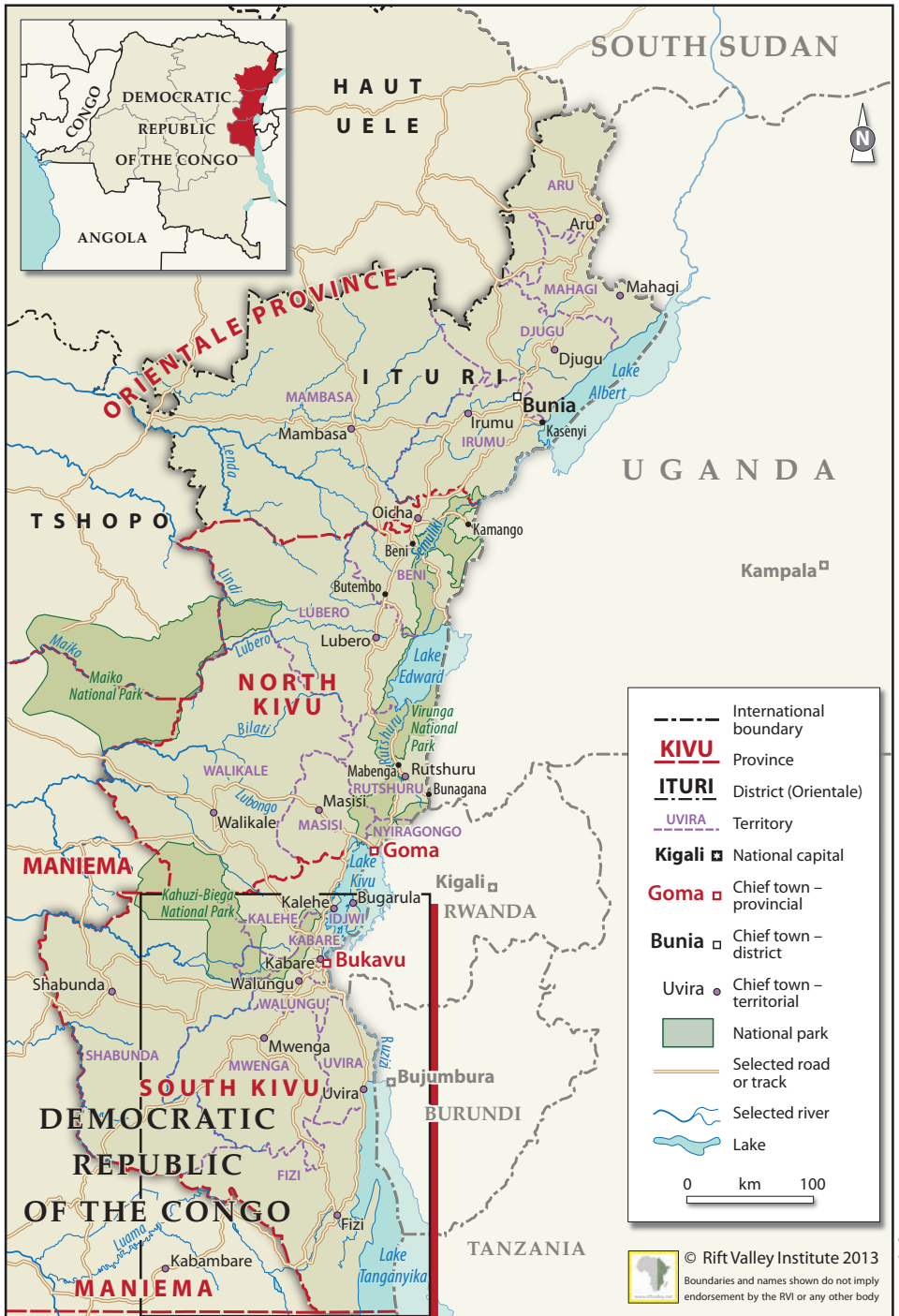
Map 1. The eastern DRC, showing area of detailed map on following page