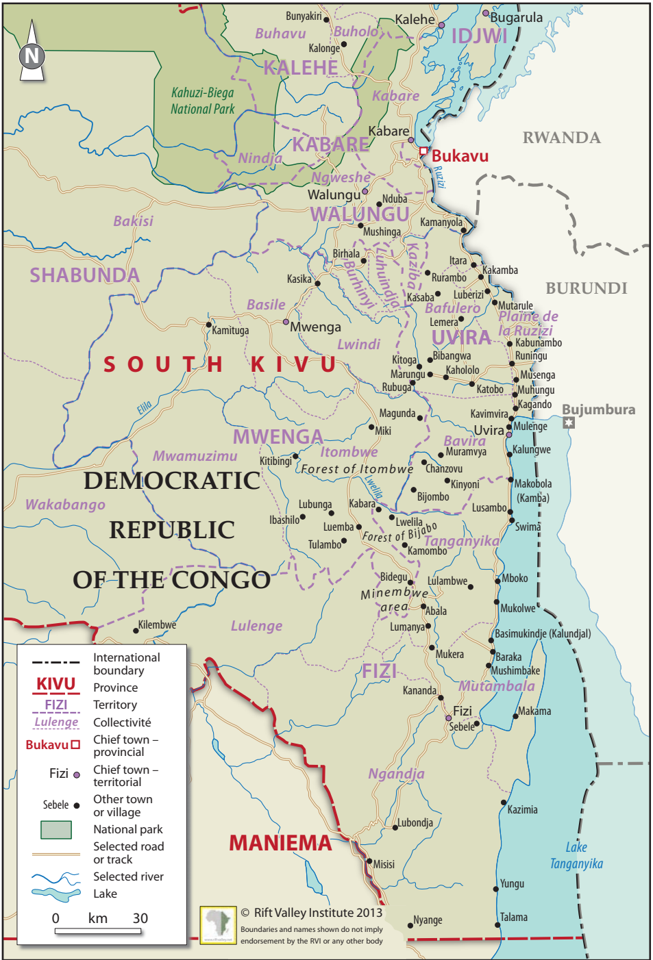
Map 2. South Kivu, showing its territoires, collectivités and main towns