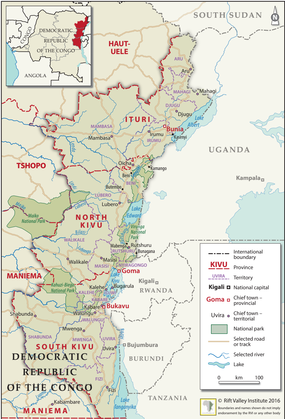
Map. The eastern DRC showing the provinces of Ituri, North Kivu and South Kivu