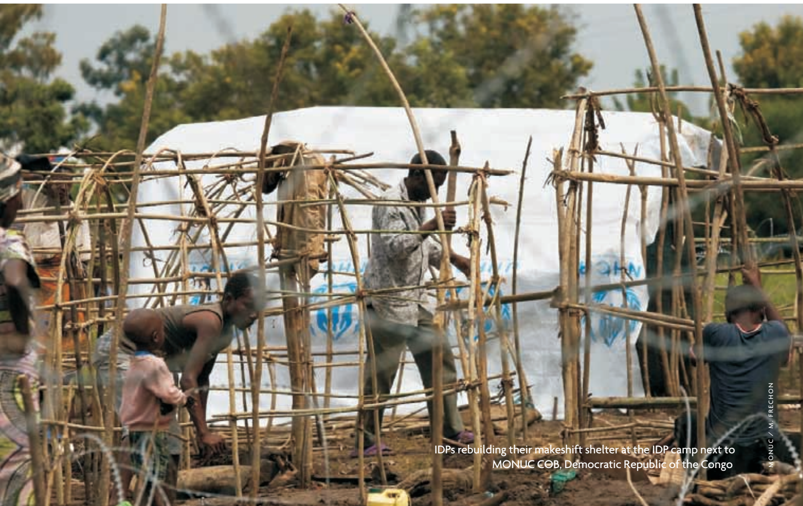
IDPs rebuilding their makeshift shelter at the IDP camp next to MONUC COB, Democratic Republic of the Congo

UNHCR continued to lead the protection cluster at the national, provincial and sub-provincial levels. It organized assessments and strategic discussions and coordinated operational responses. The protection cluster strengthened its advocacy for the respect of human rights and humanitarian law and for the deployment of security forces to protect civilians.