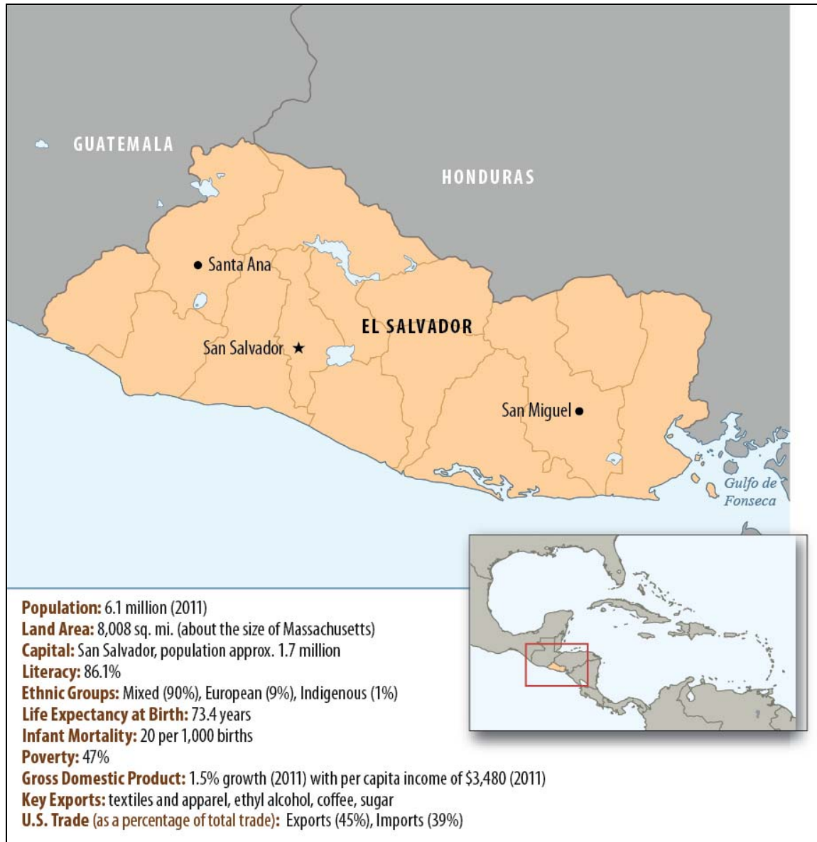
Figure I. Map and Data on El Salvador

Source: Map prepared by CRS. Data gathered from U.S. Department of State, “Background Note: El Salvador,” February 2012; World Bank, World Development Indicators ; Economist Intelligence Unit (EIU); Global Trade Atlas; U.N. Economic Commission for Latin America and the Caribbean.