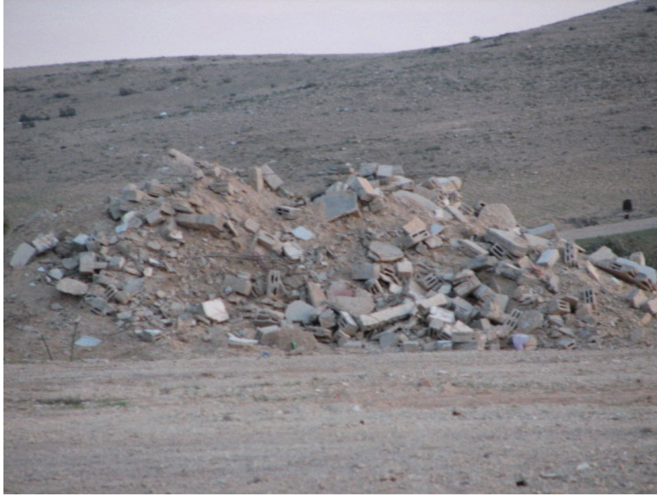
Above, Abu Solb's destroyed shop; below, his new shop, also built without a permit.