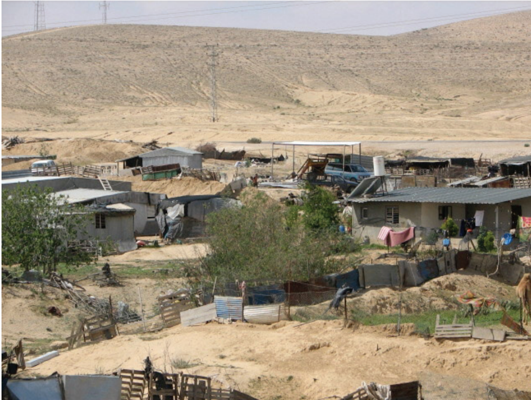
An unrecognized village of al-Sirr.