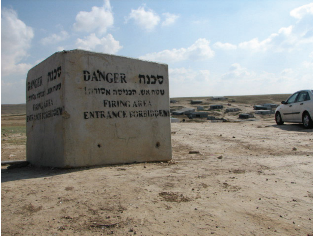
Firing Zone sign with unrecognized village in the background. A resident of a neighboring unrecognized village said the signs went up in the last couple of years, decades after the village was established.

Dr. Amer al-Hozayel described the signs in front of this village as part of the government's broader strategy for Bedouin land confiscation in the Negev: