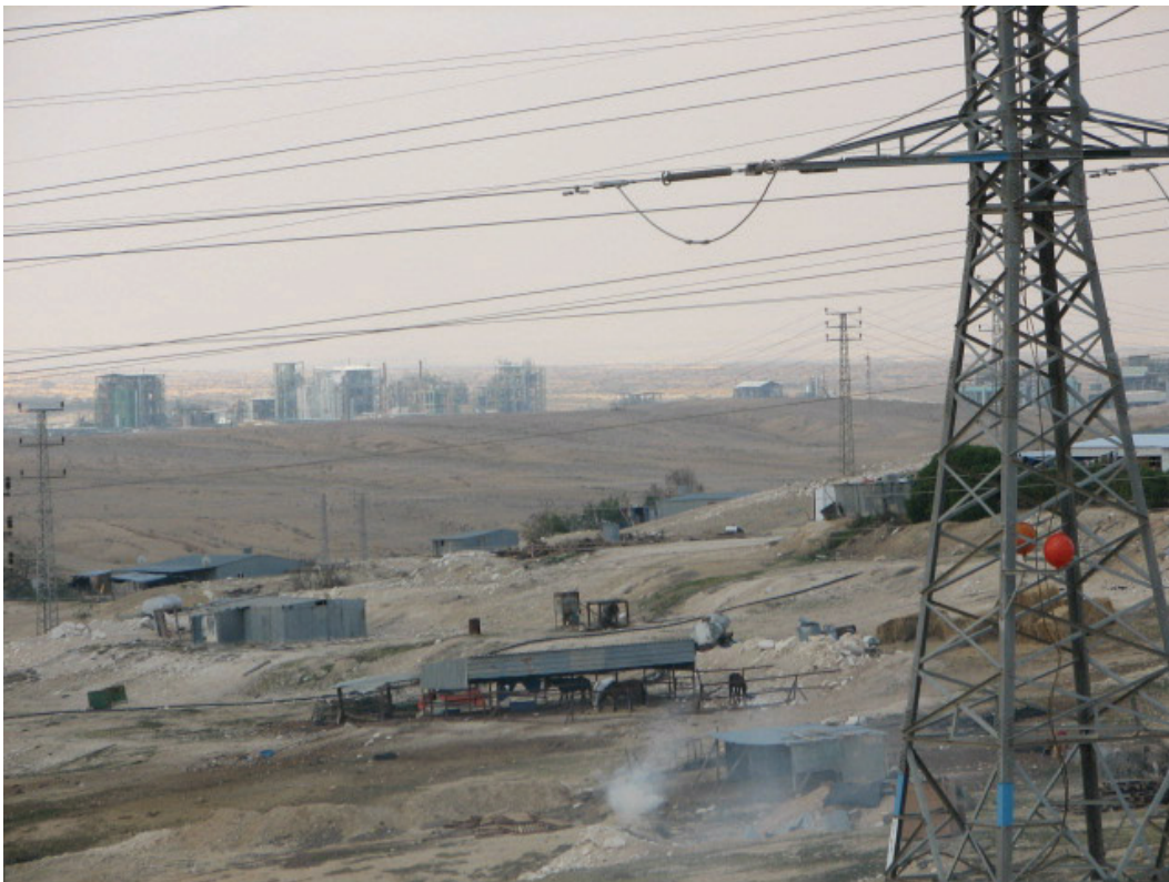
Houses in the unrecognized village of Wadi al-Ne'am, under electric wires and pylons with Ramat Hovav factories in the background.

percent of Israel's chemical factories and the country's only toxic waste dump. Noxious fumes pervade the area. In 2004, the Ministry of Health released a much-delayed study documenting higher than normal cancer rates and high levels of hospitalization for respiratory illness near Ramat Hovav. Yet the authorities have consistently denied the Wadi al-Ne'am Bedouin's request to establish a new agricultural village in a different, non-toxic location. The only alternative the state has offered is a non-existent neighborhood in the already deeply deprived Bedouin township of Segev Shalom, still within the Ministry of Health's proscribed radius of Ramat Hovav. Today hundreds of families in Wadi al-Ne'am have demolition orders on their homes and nowhere to go.