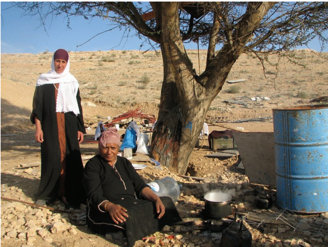
Women in Twayil cook outside after their homes were demolished.

On December 11, 8, 2007, officials from the Israel Land Administration, accompanied by hundreds of police, bulldozers, and trucks, entered the unrecognized Bedouin village of Twayil Abu Jarwal near the Goral junction in the Negev and demolished 20 structures. This was the last of eight times that ILA officials demolished homes of the al-Talalqah tribe in Twayil Abu Jarwal in 2007.