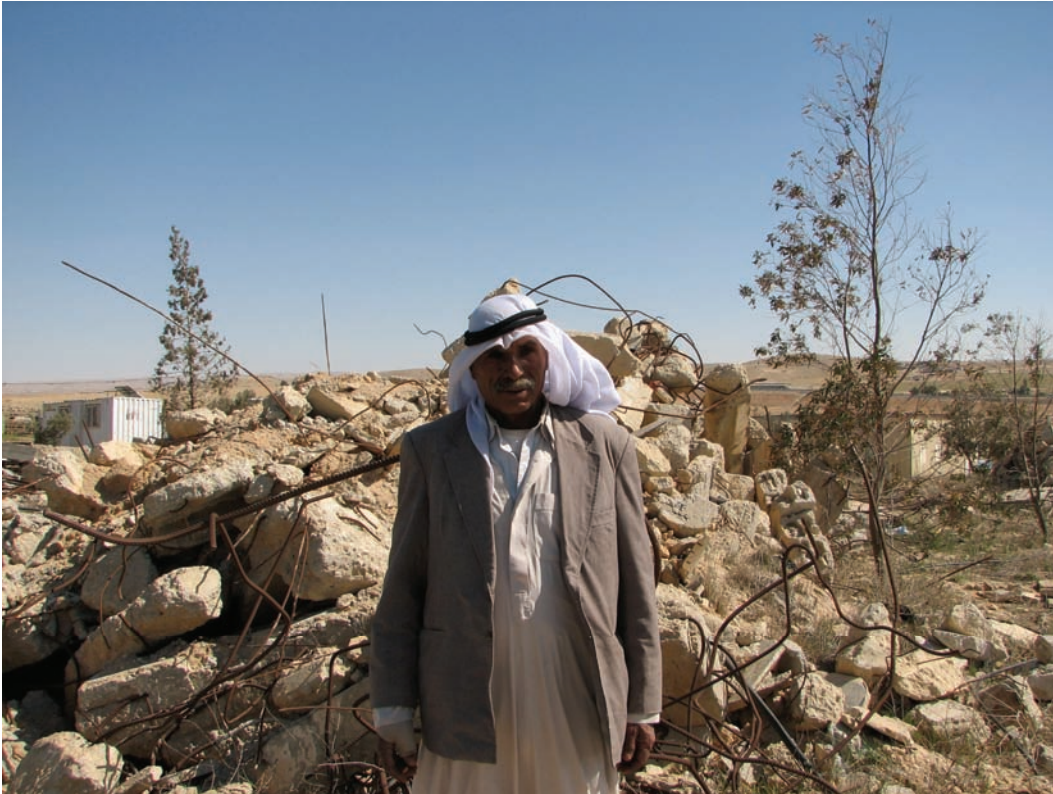
The brother referred to in the above testimony in front of ruins of his house demolished in 1993.

My brother was forced to demolish his house in 1993. The court decision was either a fine and jail or demolish the house himself. My brother had a beautiful house, and it was expensive to build. He had taken loans to build it, and then he had to demolish it. My brother served in the [Israeli] army his whole life and still lost his home. 197