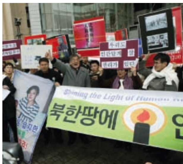
Human rights groups in Seoul protest against DPRK abuses

One positive development was DPRK's engagement with UNICEF and the Committee on the Rights of the Child, including an invitation to the Committee to review progress in improving children's rights. Some