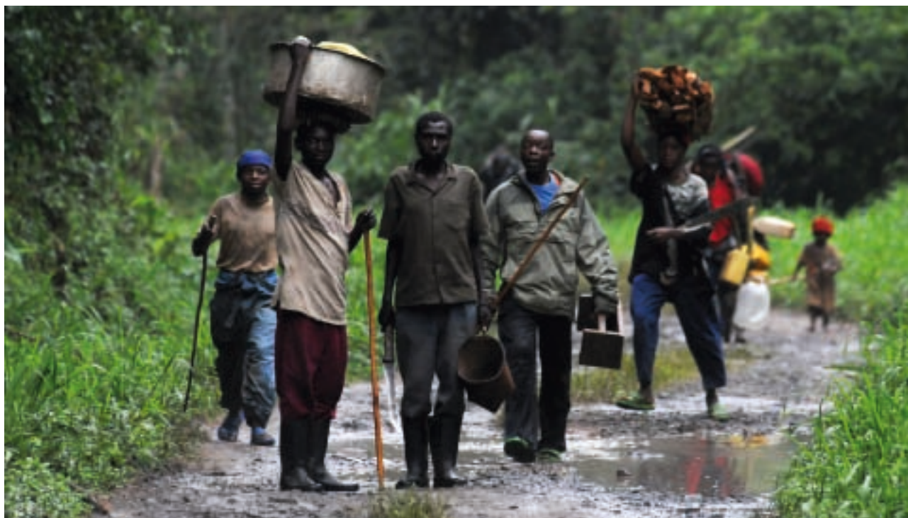
Displaced people attempting to escape fighting between the Congolese army and the FDLR in February

On 4 July, the DRC government made the welcome announcement of a “zero tolerance” policy against