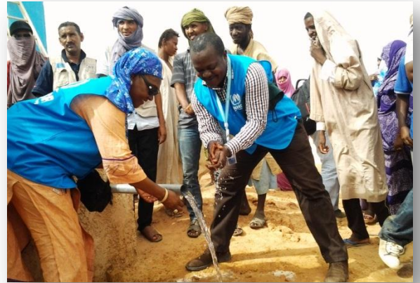
Water point in Mberra Camp.