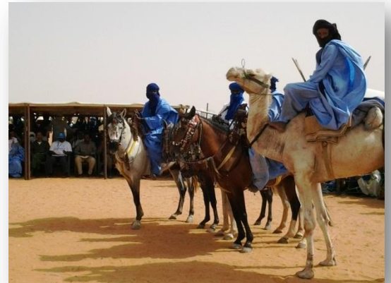
Celebrations of World Refugee Day in Mberra Camp