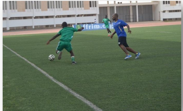
Football match between urban refugees and Mauritanian nationals in Nouakchott