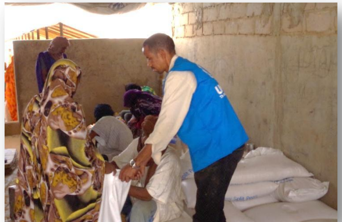
June food distribution in Mberra Camp.