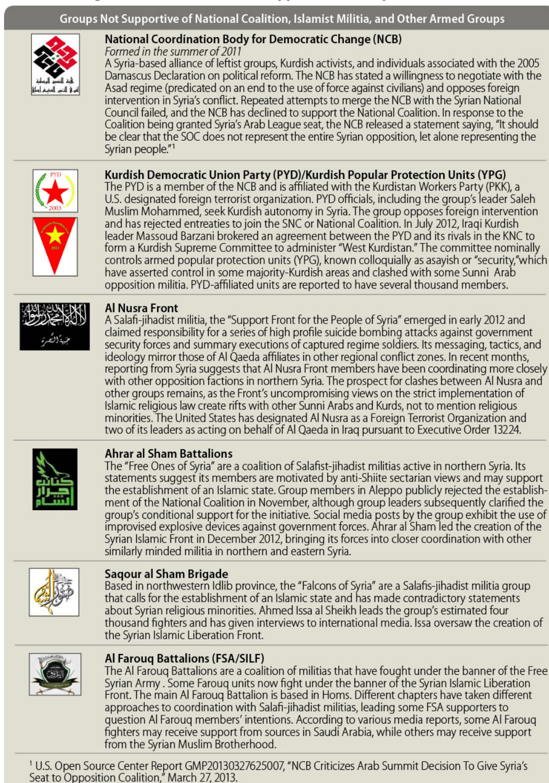
Figure 4. Profiles of Select Opposition Groups and Militias

Source: CRS. Derived from U.S. government Open Source Center reports, social media, and independent analyst reports. The positions, sizes, platforms, and membership of groups are subject to change.