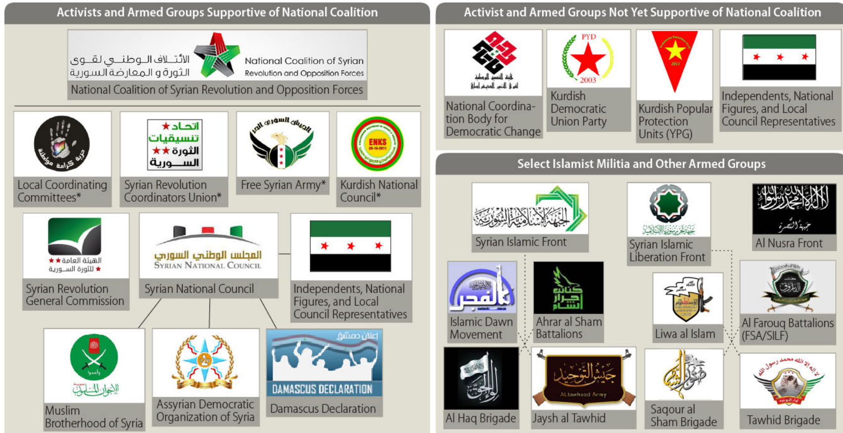
Figure 2. Syrian Opposition Groups: Relationships and Factions

* Many of the groups that supported the creation of the National Coalition of Syrian Revolution and Opposition Forces have diverse memberships of local activists, factions, and brigades. These actors may hold differing views of the National Coalition and its decisions. The Kurdish National Council (KNC) reportedly offered conditional support for the Coalition if several political issues, including Kurdish representation in the Coalition and rights in a future Syria, would be addressed. The KNC was allocated membership in the Coalition, but its support is still being determined. Coalition leaders reportedly have deferred decisions regarding the constitutional issues raised by the KNC until a democratically elected government has been formed.