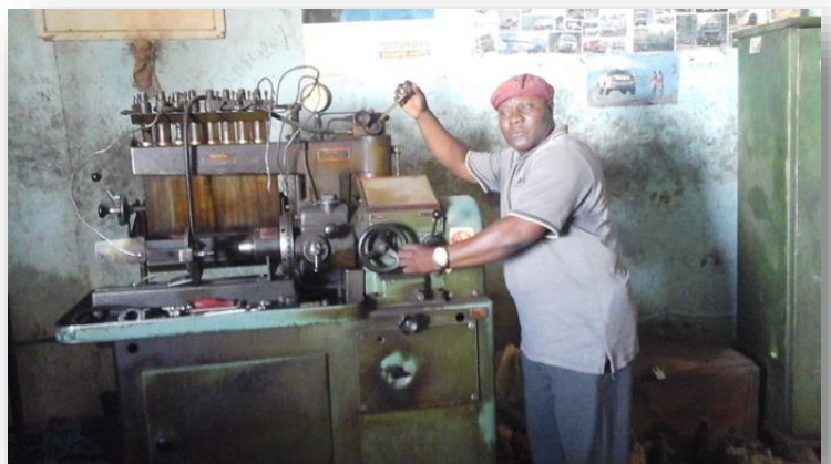
Refugees in Nouakchott and Nouadhibou have access to vocational training provided by UNHCR