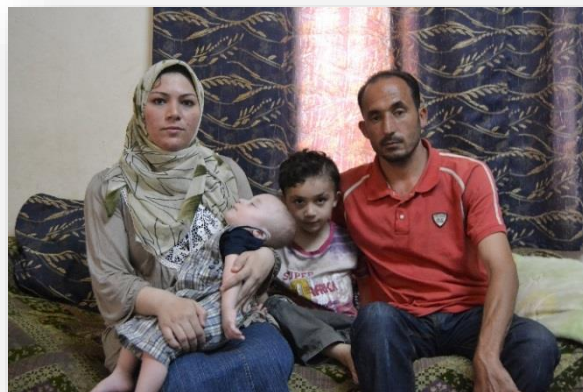
Syrian family in Nouakchott