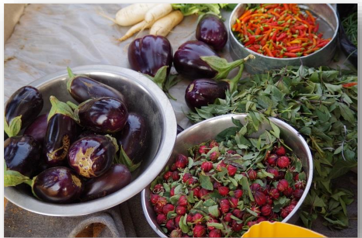
Gardening products in Mberra Camp.