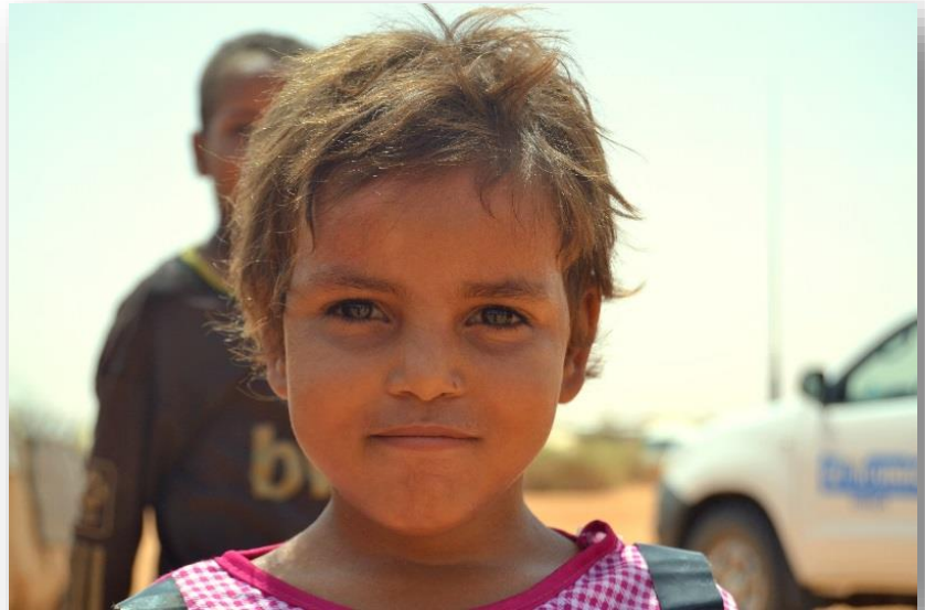
A 6-year-old girl starts school in Mberra Camp.