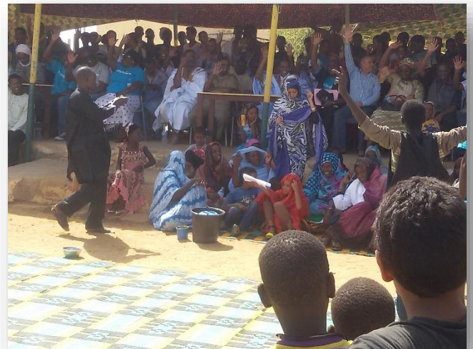
A sketch on the occasion of Global Hand Washing Day in Mberra Camp.