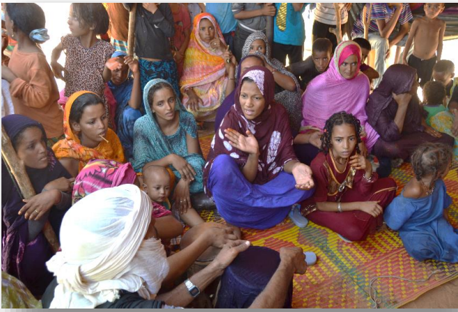
Raising awareness is the key to prevent waterborne diseases in Mberra Camp.