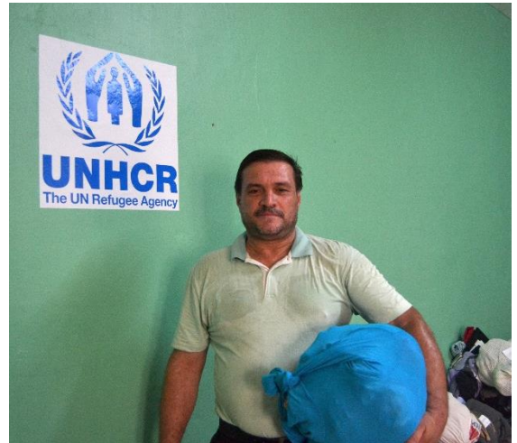
Distribution of UNIQLO clothes to refugees in Nouakchott