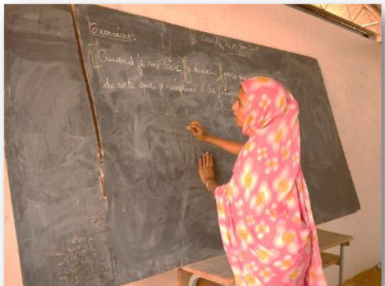
UNHCR continues to support education for all refugees in Mberra Camp.