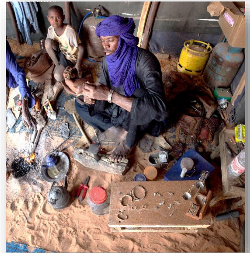
Jewellery making in Mberra Camp.