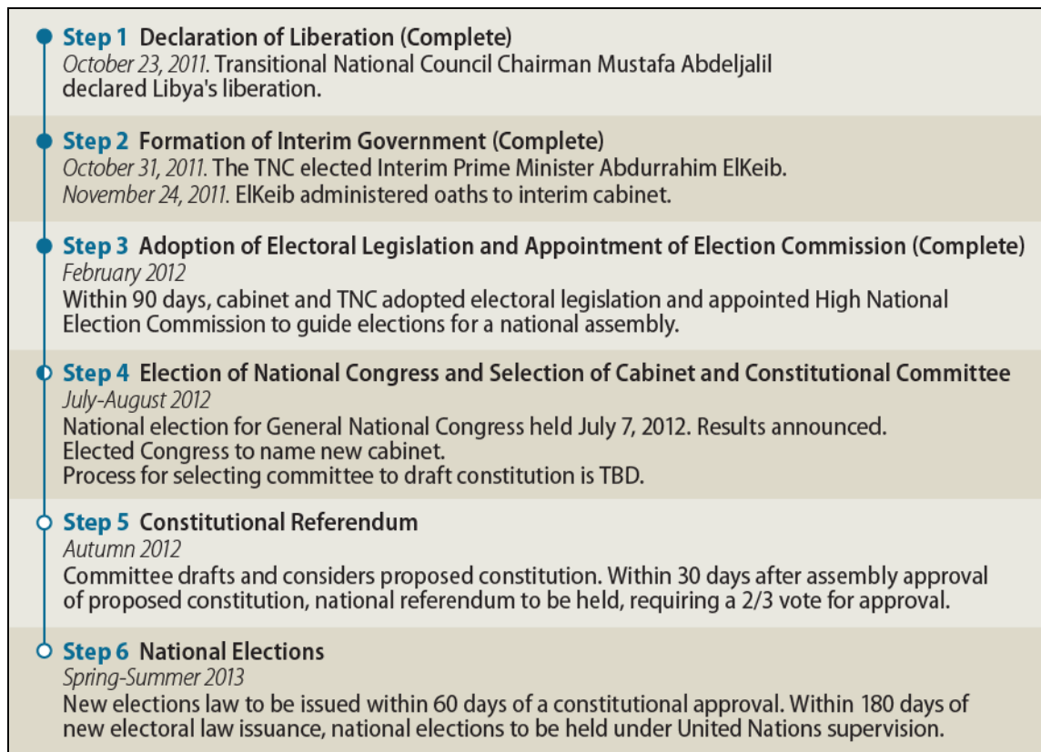
Figure 3. Libya's Proposed Transition Timeline