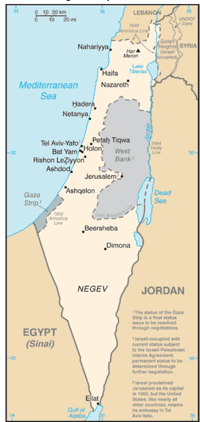
Figure 1. Map of Israel