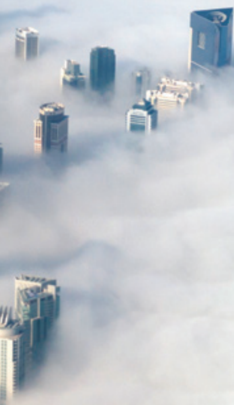
High-rise buildings emerging through fog, Doha, Qatar, February 2014.