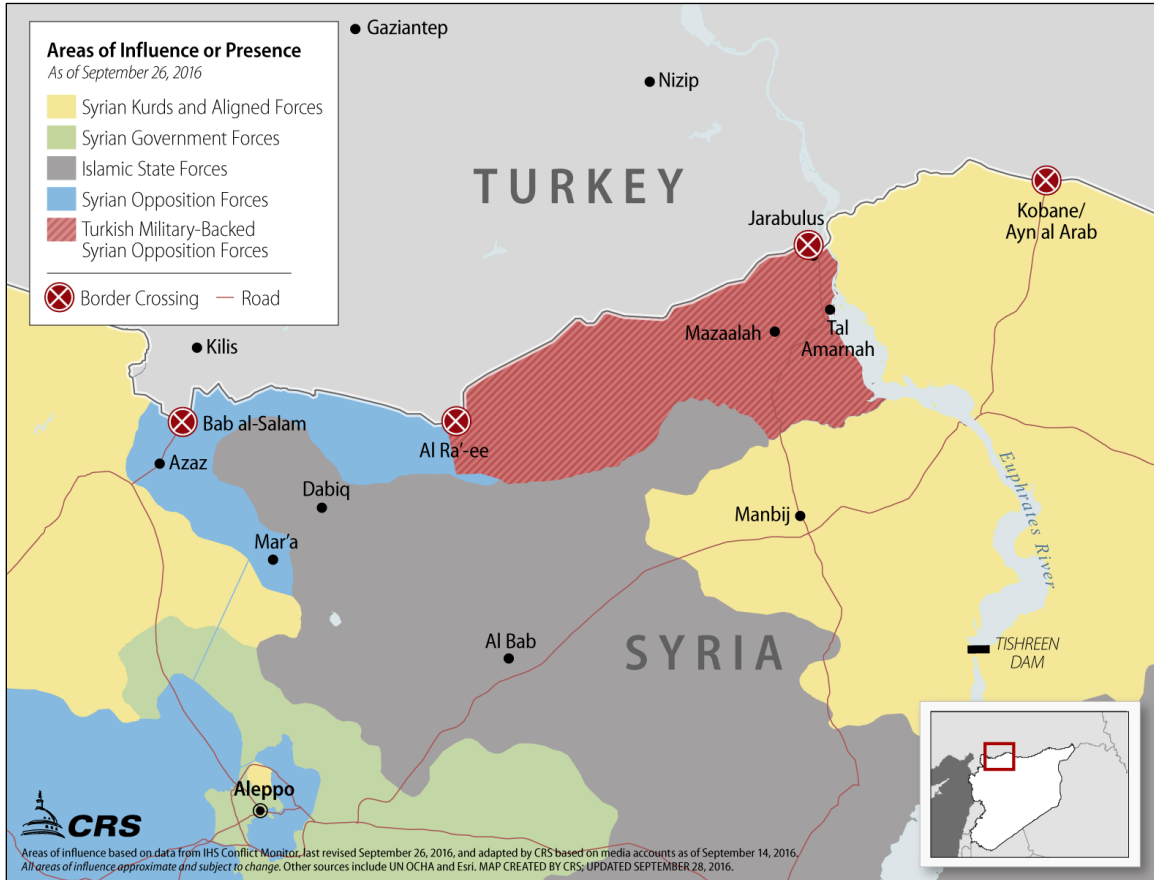
Figure 2. Syrian-Turkish Border

Russian airstrikes. These Russian strikes, as well as the Syrian airstrikes against Kurdish forces in Al Hasakah, highlight one of the key issues in the policy debate on Syria—that of how the United States should respond to strikes against U.S.-backed forces.