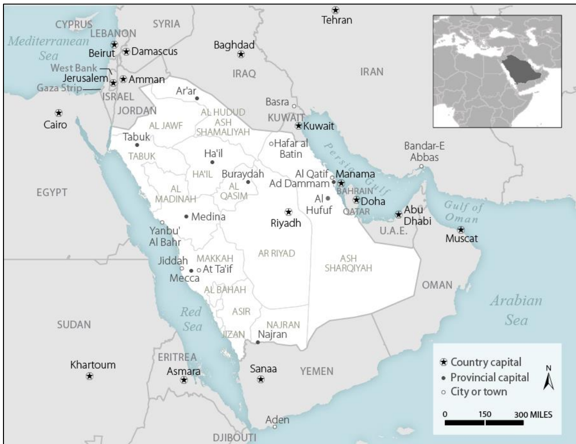
Table I. Saudi Arabia Map and Country Data

Land: Area, 2.15 million sq. km. (more than 20% the size of the United States); Boundaries, 4,431 km (~40% more than U.S.-Mexico border); Coastline, 2,640 km (more than 25% longer than U.S. west coast)